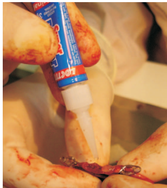
Figure 3 – Application of ethyl-2-cyanoacrylate adhesive in cecal stump.