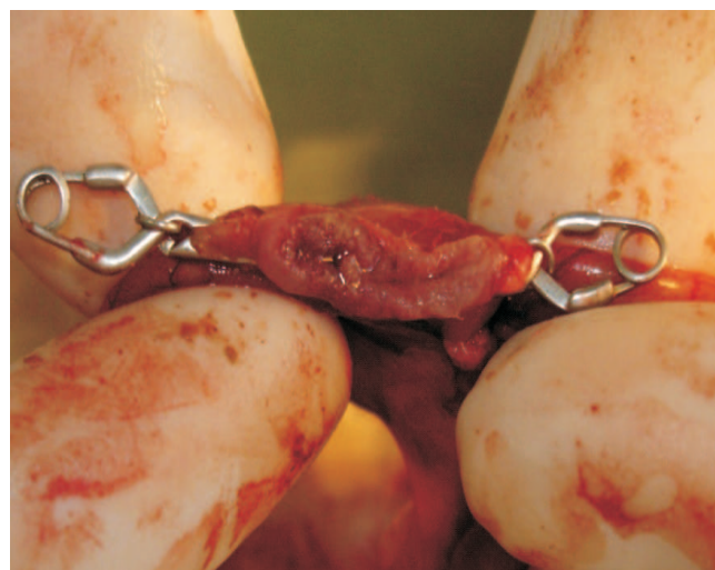
Figure 4 – Final appearance of the cecal stump treated with ethyl-2-cyanoacrylate adhesive, prior to clips removal.

presence and degree of adhesion formation, presence of nodules, enlarged lymph nodes, fistulae, abscesses, among others. The grading of adhesions adopted was the one proposed and modified by Diogo Filho 4 .