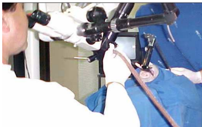
Figure 1 – Technique for the endoscopic application of mitomycin-C on the surface of vocal folds in an anesthetized animal, using a surgical microscope with an infant laryngoscope in place.

The histological study was conducted using picosirius red staining with polarization microscopy, in which the non-collagenous material stained black and collagen stained yellow, orange-red and red. Those colors were selected through the software for quantification and summation of the selected areas in square micrometers. The reading of the slides was always performed in triplicate through the Image Pro plus 4.5® for Windows® software on a microcomputer coupled to an Olympus® BX50 microscope