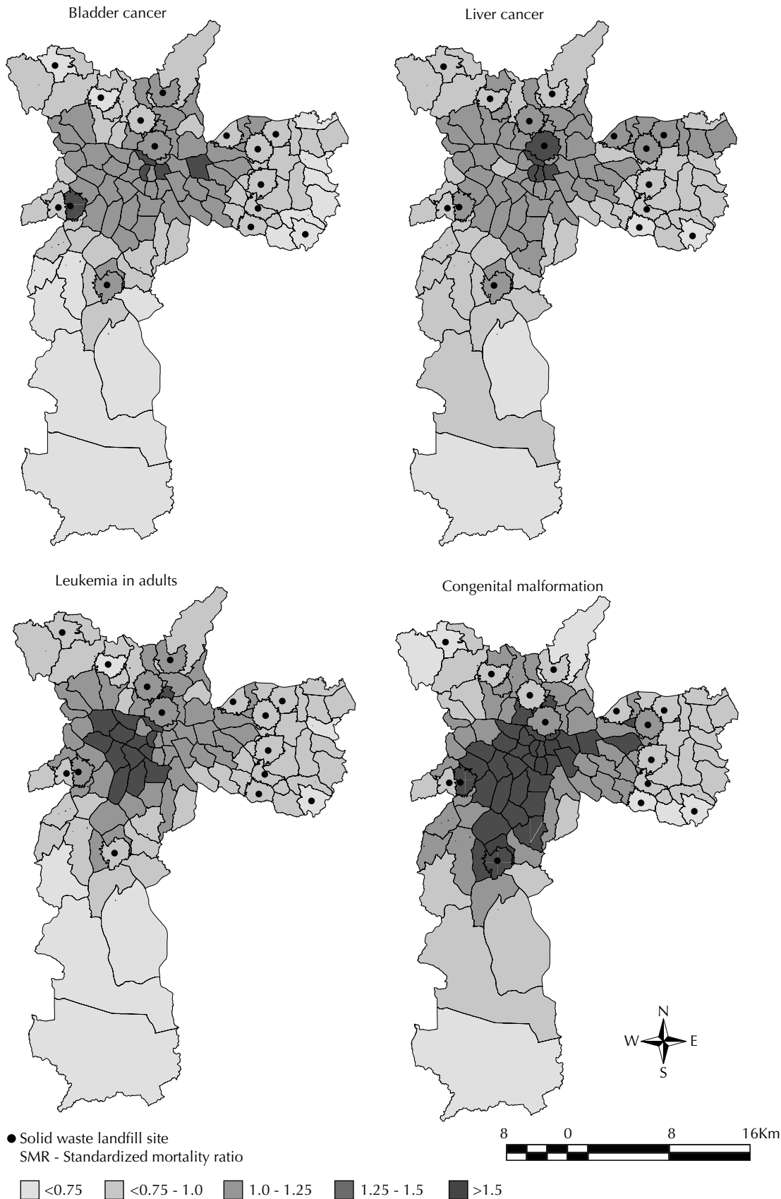
Figure 2. Standardized mortality ratios for the areas of radius 2 km around the solid waste landfill sites and other districts. City of São Paulo, Southeastern Brazil, 1998-2002.