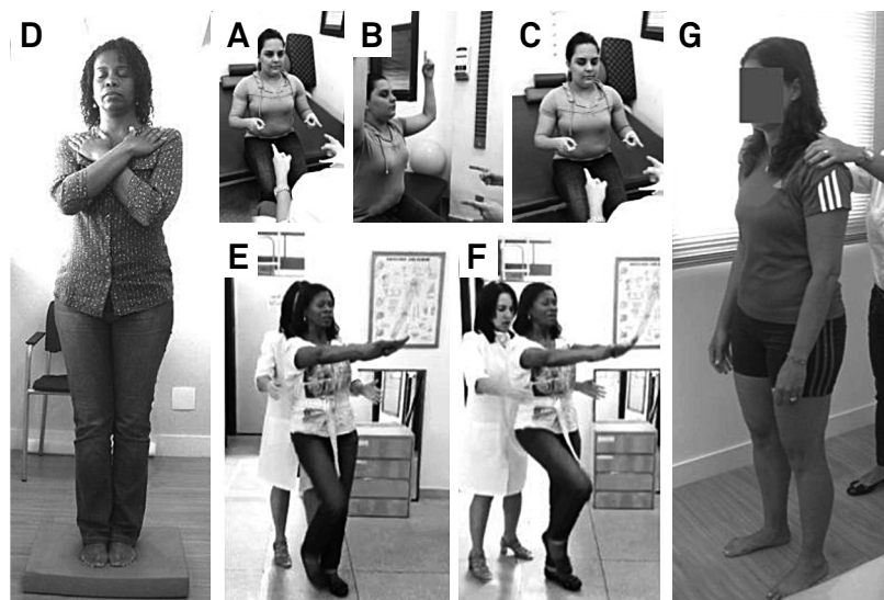
Figure 2. Vestibulo-spinal reflex tests. Past pointing (A, B, C); m-CTSIB step 4 (D); Fukuda test (E, F). fall risk: pull test (G).