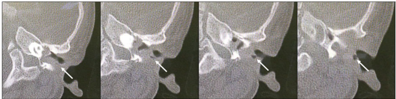
Figure 2. Preoperative CT-scan. Consecutive axial sections, the white arrow points at the sinus of the cartilaginous auditory canal.

structures. A concurrent bilateral serous otitis media was seen. Audiometry was performed and showed a conductive hearing loss fitting with a bilateral otitis media. Surgery was planned; because of the aforementioned clinical findings an uncommon surgical approach was chosen. A less invasive marsupialization technique was performed as opposed to the commonly performed excision, primarily because of the favorable position of the anomaly next to the external auditory canal, not extending deeply in the parotid gland or facial nerve. Prior to marsupialization the end of the sinus was verified using a sinus probe. The sinus seemed to consist of both skin and cartilage. The sinus was marsupialized making a lengthwise incision of the cartilaginous external auditory canal. Bilateral ventilation tubes were inserted. The surgery was performed using NIM ® nerve monitoring of the facial nerve. On follow-up three months after surgery, the external auditory canal was healed and there was no sign of recurrence of the sinus (Figure 3). The patient did not have complaints of recurrent infections, there were no complications and the patient made an uneventful recovery. Audiometry (otoacoustic emission) was performed and showed bilateral normal hearing.