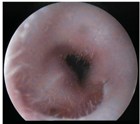
Figure 3. Postoperative otoscopic image. This otoscopic image was taken at 3 months follow-up.

structures. A concurrent bilateral serous otitis media was seen. Audiometry was performed and showed a conductive hearing loss fitting with a bilateral otitis media. Surgery was planned; because of the aforementioned clinical findings an uncommon surgical approach was chosen. A less invasive marsupialization technique was performed as opposed to the commonly performed excision, primarily because of the favorable position of the anomaly next to the external auditory canal, not extending deeply in the parotid gland or facial nerve. Prior to marsupialization the end of the sinus was verified using a sinus probe. The sinus seemed to consist of both skin and cartilage. The sinus was marsupialized making a lengthwise incision of the cartilaginous external auditory canal. Bilateral ventilation tubes were inserted. The surgery was performed using NIM ® nerve monitoring of the facial nerve. On follow-up three months after surgery, the external auditory canal was healed and there was no sign of recurrence of the sinus (Figure 3). The patient did not have complaints of recurrent infections, there were no complications and the patient made an uneventful recovery. Audiometry (otoacoustic emission) was performed and showed bilateral normal hearing.