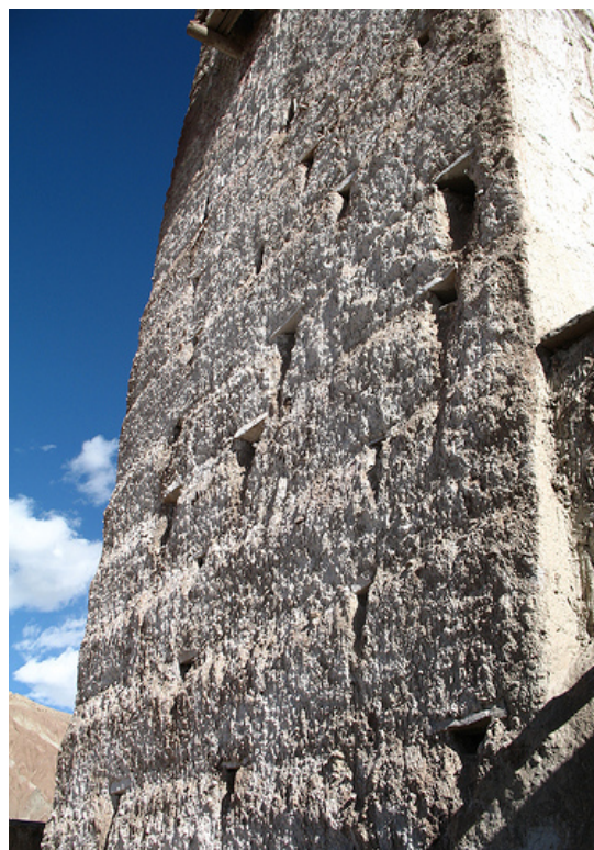
Figure 1. Basgo fort, possibly constructed before 1357.

Figure 3 shows a copy of a Farsi manuscript, part of a larger collection held at the British Library and drawn around the middle of the 19th century describing all types of construction techniques in Srinagar at that time (possibly from the collection of William Moorcroft or Alexander Cunningham [10]). This manuscript clearly shows the type of formwork adopted the size and shape of the rammers, and other implements used in construction. The base of the formwork, within the stone layer shows horizontal support timbers ( mechinales in Spanish) which support the vertical timbers restraining the formwork. When these mechinales timbers are removed they leave the characteristic ‘putlog’ or formwork support holes seen in the walls at Basgo. Unfortunately only one layer of construction is shown, rendering it impossible to determine how the next lift was formed. The rammer takes the form of a double ended timber, around 1.5 m long, with a thinner section in the centre.