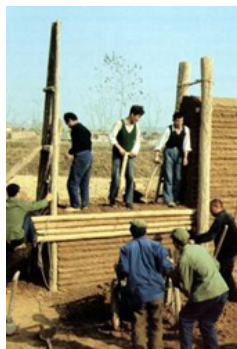
Figure 10. New rammed earth building in Shangri-La (Zhongdian) County, Yunnan [17].