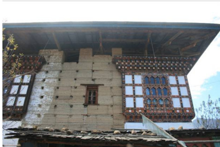
Figure 7. Modern rammed earth in Bhutan.