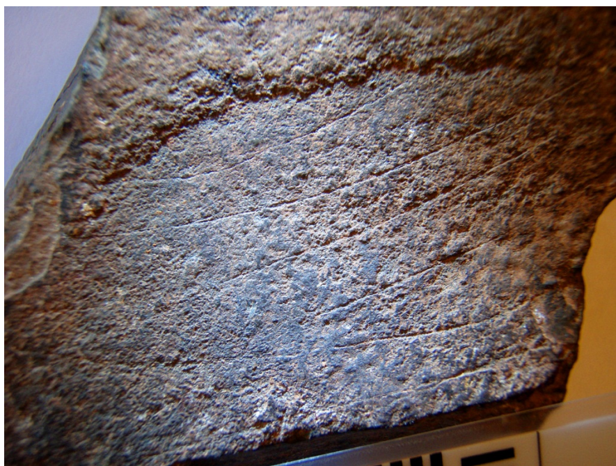
Figure 4. Stone plaque bearing seven engraved lines from Wonderwerk Cave, South Africa, c. 300,000 years old.