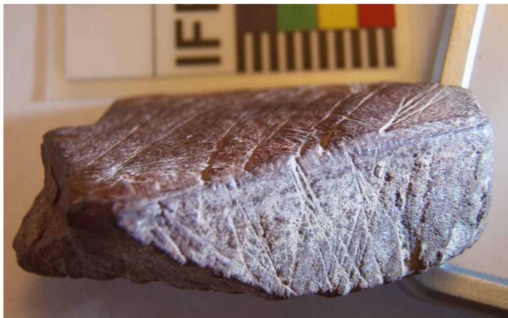
Figure 5. Stone plaque almost completely covered by engravings, Wonderwerk Cave, c. 70,000 years old.

Before discussing the final class of palaeoart objects, beads and pendants, one unusual object is to be considered. An anthropomorphous dolomite piece from Mumbwa Caves, Zambia, is the only proto-figurine so far proposed for the MSA (Barham 2000) [4]. Deposited during the OIS5e interval, i.e.