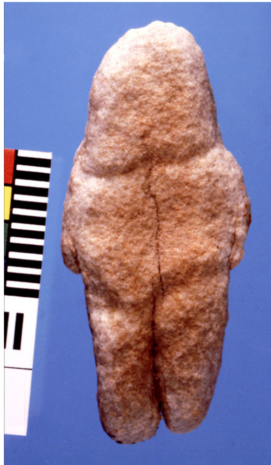
Figure 2. The Tan-Tan proto-figurine, Morocco, a natural object that was modified to emphasise its human form during the middle Acheulian.

The Tan-Tan proto-sculpture from a fluvial terrace deposit on the north bank of the River Draa in southern Morocco is from a rich assemblage of middle Acheulian lithics, which in this region are in the order of between 300 and 500 ka old (Figure 2). The quartzite object is of natural form, but has been modified. Five of symmetrically located eight grooves that emphasise its human form were made by careful impact, and traces of haematite suggest that it was once coated in red colour (Bednarik 2001, 2003b) [45,50]. It is one of only two known proto-sculptures of the time, the second being the probably slightly younger late Acheulian specimen from Berekhat Ram, Israel (Goren-Inbar 1986; Goren-Inbar & Peltz 1995) [104,105]. That period has also yielded a manuport from Morocco, the Triassic Orthoceras sp. cast from Erfoud site A-84-2 in the Sahara near the eastern border of the country (Bednarik 2002a) [46]. This fossil cast resembles a human penis closely and was found in the remains of a stone-walled dwelling or windbreak, together with Acheulian tools (Figure 3). Although such fossils are very common in northern Morocco, they do not occur naturally in this region.