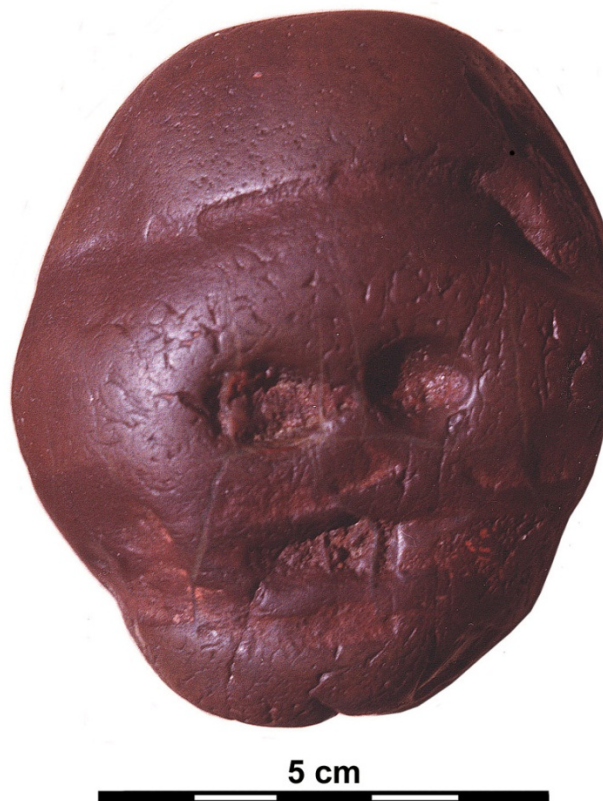
Figure 1. The Makapansgat cobble, South Africa, carried to a cave and deposited almost 3 million years ago.

In contrast to the comprehensive early appearance of pigment use, mostly from the continent's south, Acheulian beads are so far limited to those of one site in the north. The ostrich eggshell beads from the Late Acheulian of El Greifa, Libyan Sahara, are about 200 ka old according to Th/U dating