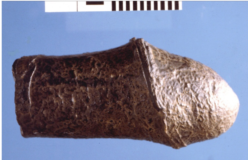
Figure 3. Fossil cast from Erfoud in Morocco, a late Acheulian manuport.

Acheulian dwelling remains are found elsewhere in the Sahara (see below) and also known from India and Europe.