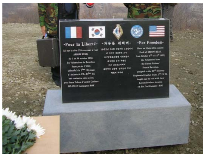
Figure 6. Arrowhead stele, facing the DMZ line.

French, Korean and US flags are displayed alongside, with the UNO Symbol and French battalion insignia.