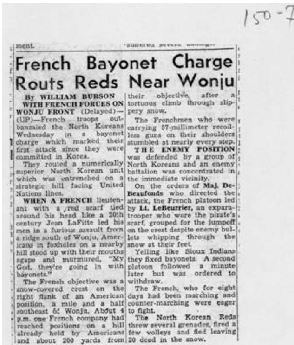
Figure 2. Stars & Stripes Pacific Edition article, January 1951.