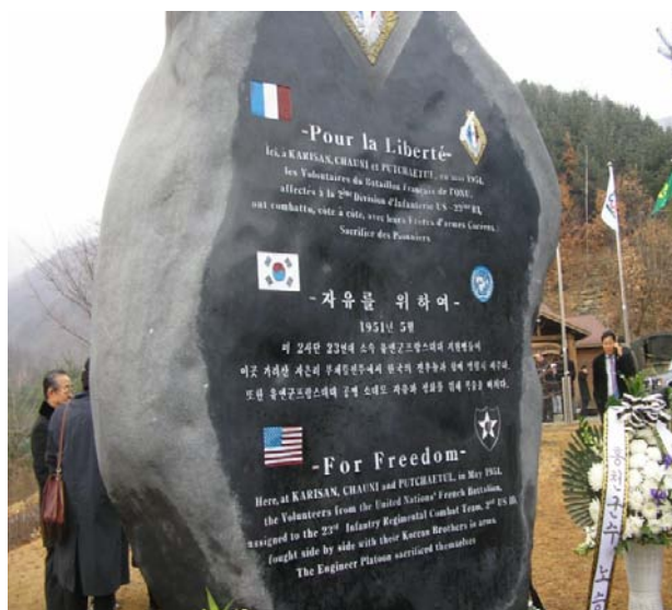
Figure 4. The Puchaetŭl Monument.

A collection of steles and monuments, explaining briefly the conditions of the fight and the French Army's participation in the war, under the motto "For Freedom" ( Pour la liberté, Jayu-rŭl wihayŏ ) (Figure 4), written in the three languages, with the UNO, French, South-Korean and US flags, the insignia of the French battalion and also the badge of the 2nd US Infantry division, was erected.