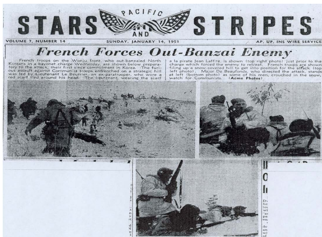
Figure 1. Front page of the Stars & Stripes Pacific Edition, January 1951.

During an address to the US Congress in May 1952, General Ridgway said of the French battalion: I shall speak briefly of the 23 rd United States Infantry Regiment, Colonel Paul L. Freeman commanding, [and] with the French battalion... Isolated far in advance of the general battle line, completely surrounded in near-zero weather, they repelled repeated assaults by day and night by vastly superior numbers of Chinese. They were finally relieved....I want to say that these American fighting men, with their French comrades-in-arms, measured up in every way to the battle conduct of the finest troops America and France have produced throughout their national existence [39].