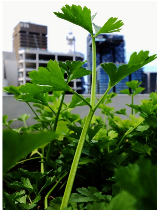
Figure 5. Winning photograph in the 2013 staff category by Simona Galimberti

It is relevant that environmental sciences students value photography and also to notice that high rise of Sydney is in the background and a focus.