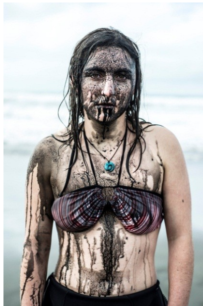
Figure 4. Photograph judged third in the 2013 student category by Matthew Goodman.

The photographer noted his intention for the photo to present the message with few words to explain it as was requested by the competition guidelines. Other competition photographs seemed to rely on the words of the accompanying caption and also the short explanation of how the photograph suits the theme of sustainability that were both requested as part of the entry. This request may have led potential entrants to believe that judges would take these explanations into account when appraising the alignment of the photograph to the theme of sustainability. It is suggested that it be written clearly that the judges evaluate how the photograph conveys the theme of sustainability and they do not read the caption or explanation.