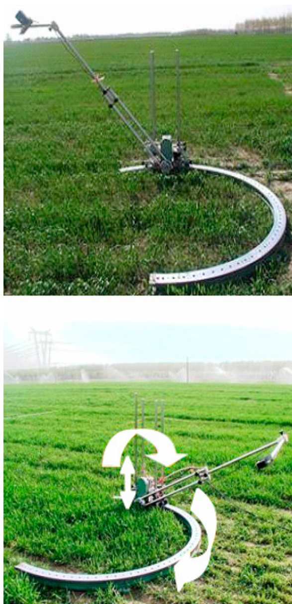
Figure 1. Rotating bracket for observing BRDF canopy reflectance.

The same spectral instrument used for measuring in situ canopy reflectance spectra was used to take canopy bi-directional reflectance function (BRDF) reflectance spectra under cloud-free conditions between 10:00 a.m. and 14:00 p.m. (Beijing local time) at a principal plane and a cross-principal plane on 28 April (Booting, Zadoks 41), 9 May (Flowering, Zadoks 65), and 16 May (Milk development, Zadoks 73), in 2004. The similar canopy BRDF reflectance spectra were taken on 28 April, 11 May, and 16 May, in 2007. In accordance with the measuring method introduced by Huang et al. [26], a rotating bracket was used to fix the spectral instrument (Figure 1). View zenith angles were from -60^\circ to 60^\circ with 10^\circ intervals. The negative angles represented face-to-the-sun, while the positive angles represented back-to-the-sun. Twenty spectra were taken at each view angle.