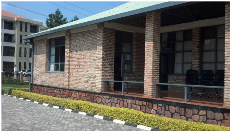
Fig. 9.3: Outside of ILPD Law Library

The ILPD library is run by librarian Justin Rwabukwisi, with no formal education in law or librarianship. An annual budget is given to the library for acquisitions, but the library relies in substantial part on donations to the collection. This collection contains approximately 6,000 monographs related to the law. Primary legal materials in print include all current copies of the Official Journal. Additionally, two computer labs with 20 computers each provide access to the internet and some online databases for legal research. Like most of Rwanda's law libraries, the ILPD library collects some non-legal periodicals, such as regional magazines and newspapers, for local consumption. The library is open to the public, however, due to its relatively rural location approximately one hour from Kigali, there are no major legal or citizen communities to serve outside students at ILPD.