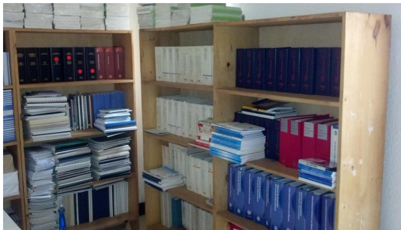
Fig. 9.10: Items in the KBA Law Library