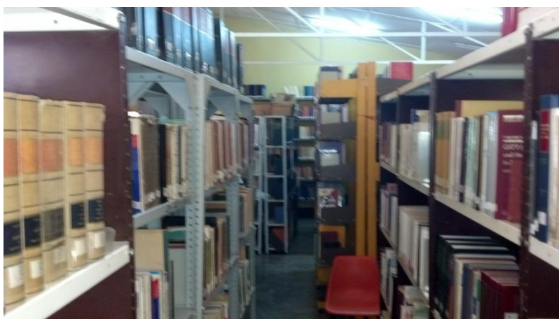
Fig. 9.2: Stacks in NUR Law Library