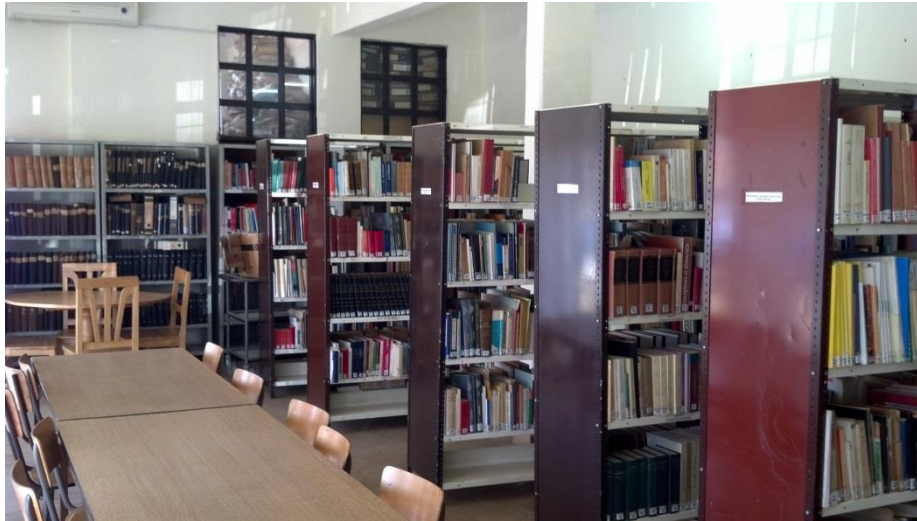
Fig. 9.9: Law Library at Ministry of Justice