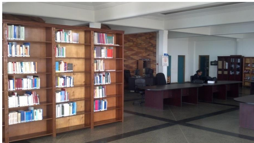
Fig. 9.5: Parliamentary Law Library

The Parliamentary archives are also housed in the Parliament building in two separate locations. They contain explanatory notes, records of discussion and debate from committees, and records from the plenary sessions of Parliament. These records are used, albeit infrequently by comparison to the law library, by researchers such as law students, lawyers, and judges. One staff member works in the archives, which are not well organized due to lack of space, and difficult to search. No one is able to browse the archives, and retrieval of materials from the archives is only possible through request for a specific document. By all practical measure, the Parliamentary archives are essentially a closed collection of government records.