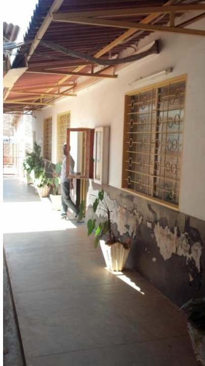
Fig. 9.1: Outside of NUR Law Library