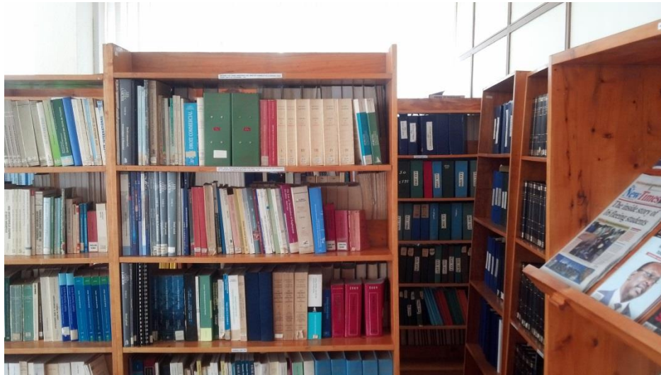
Fig. 9.6: Supreme Court Law Library

important to the work of the Court. She stated that when requests for legal materials are made that the library cannot fill, she contacts other law libraries in Rwanda to seek materials.