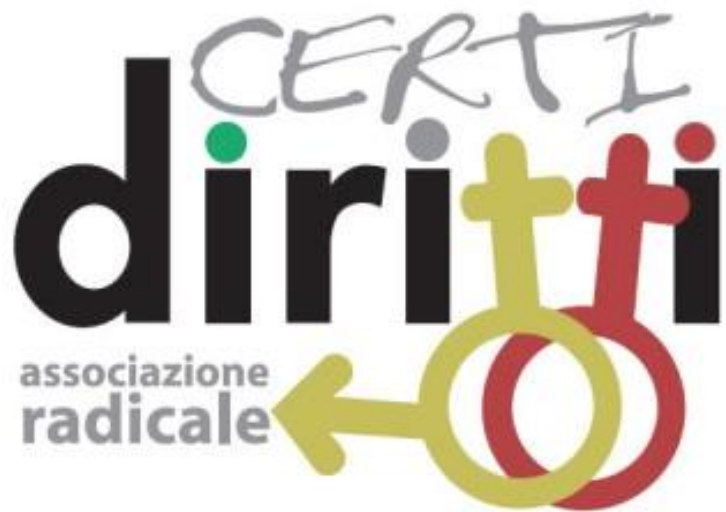
Figure 2. Certi Diritti logo.