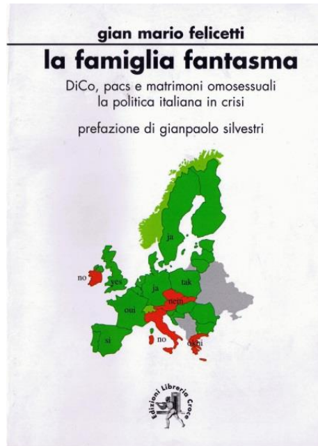
Figure 6. Cover of Gian Mario Felicetti's book La Famiglia Fantasma (2007).