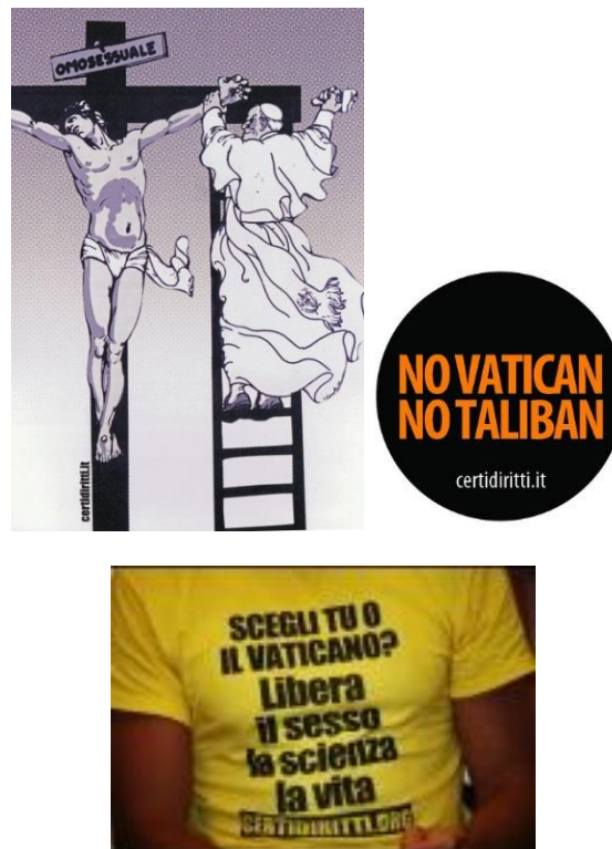
Figure 5. Paraphernalia from Certi Diritti meetings. (Personal Collection).