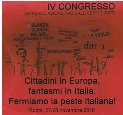
Figure 4. Badge from Certi Diritti IV Congress in Rome, held November 27-28, 2010, with the meeting theme “ Cittadini in Europa, fantasmi in Italia. Fermiamo la peste italiana! ” (translated “Citizens in Europe, Phantoms in Italy: Let’s Stop the Italian Plague!”) (Personal Collection).