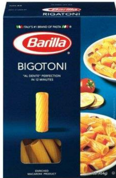
Figure 7. Satirical image of a Barilla pasta box stamped with "Bigotini" instead of "Rigatoni" that made rounds on the Internet following the Barilla Pasta Scandal.