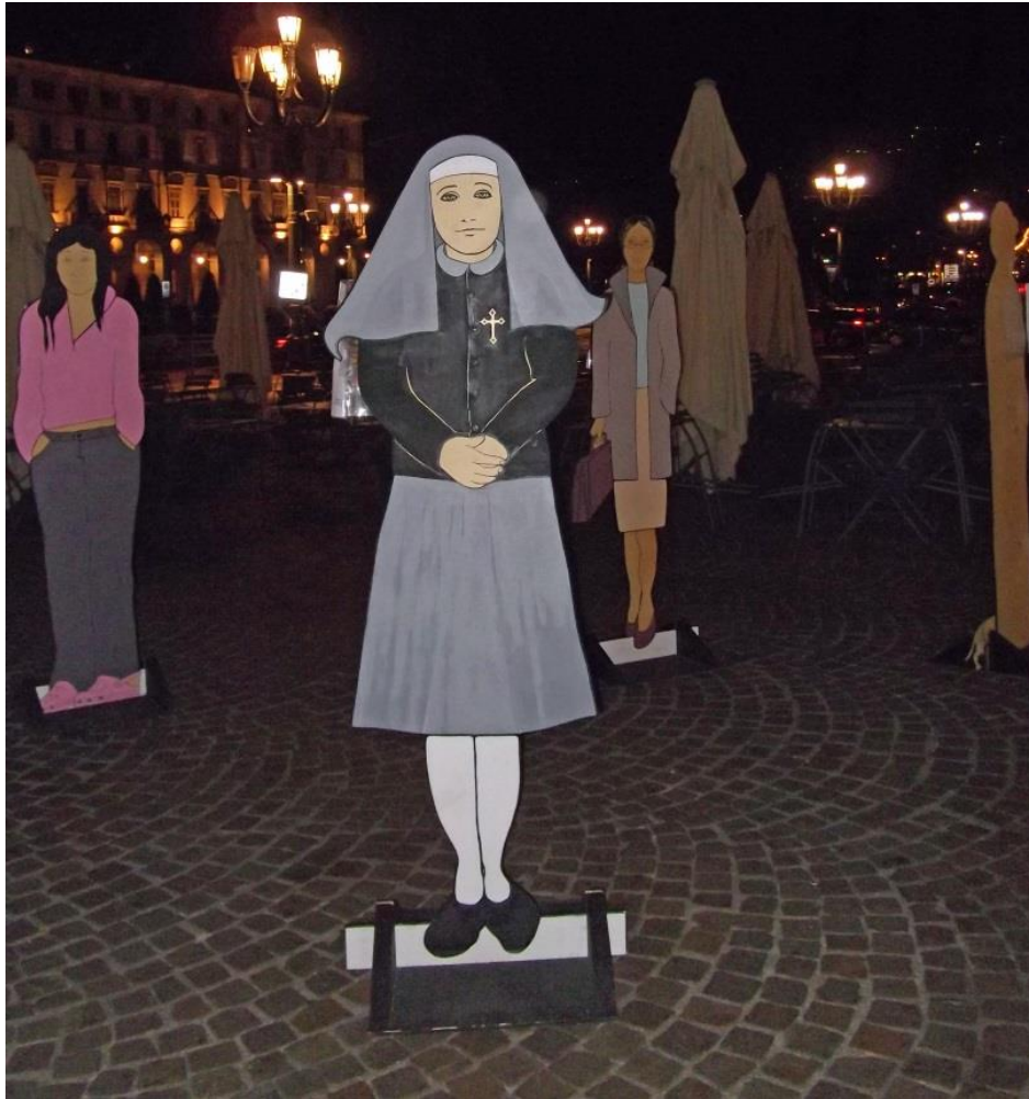
Figure 1. Photo of "Maria" from Guarda in Faccia la Violenza exhibit.