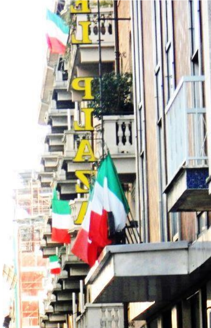
Figure 10. Flag displays in Turin. (Author's photo, taken October 2, 2011.)