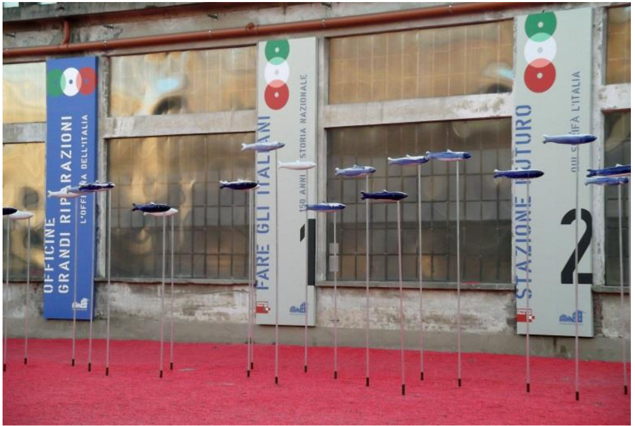
Figure 11. Signs outside Officine Grandi Riparazioni "Fare Gli Italiani" exhibit commemorating the 150 year anniversary of Italy's unification in Turin. (Author's photo, taken October 12, 2011.)