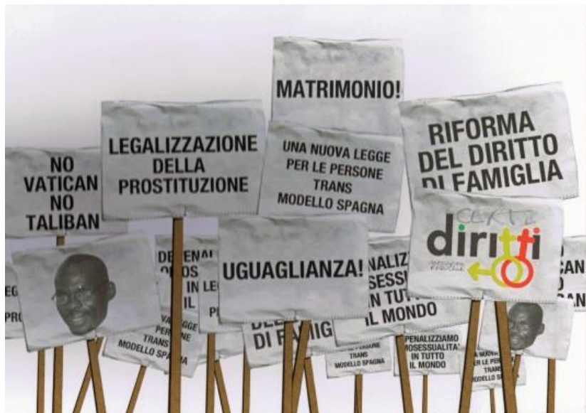
Figure 3. Certi Diritti protest signs. 67