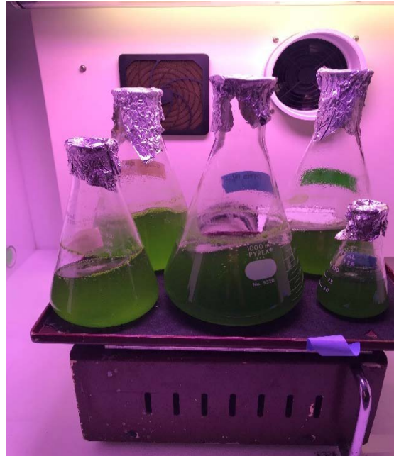
Figure 1. Algae cultures.

and proteose media. The cultures grew robustly and acquired biomass within the flasks throughout several weeks (Figure 1).