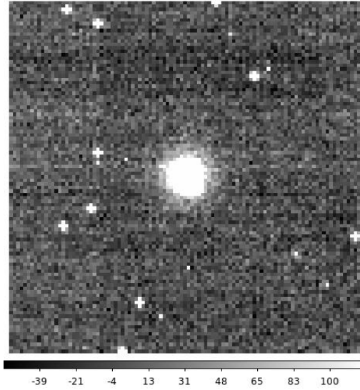
Figure 1. Snowball in Euclid detector SCS 18279_011-3_0020F038 (81 pixels affected, charged deposited \sim 3 \times 10^6 e-).

Table 1 outlines our results for each detector. We found that on some occasions a snowball event repeats in the same location. A snowball that repeats is more likely to occur in pixels that are associated with bad pixels in the operational mask, as seen by comparing the last two columns of Table 1. For the snowballs reported in Table 1, we could not find any visible features in the flat fields of the detectors at the snowball positions.