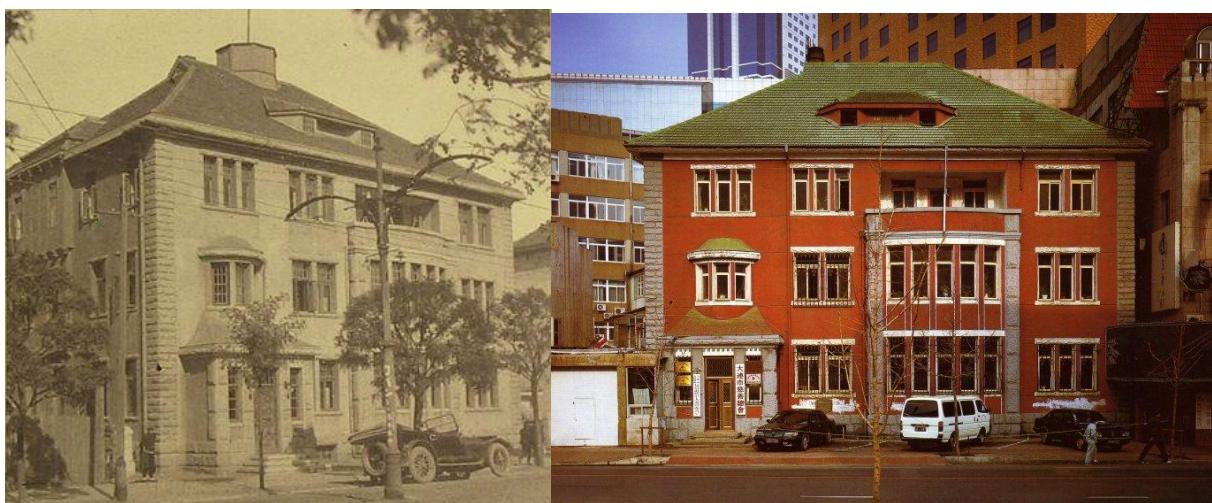
Figure 2. The Soviet consulate, built in 1925.

A three-story detached building with a basement located on 2 Lu Xun Road, Zhongshan District ‘figure 2’ has a rectangular plan shape, the area of which is 1430 m 2 . The brick volume of the structure is strict in form and elegant in proportion, sustained in the motives of classicism. The composition of the asymmetrical facade is accented by a bay window in two floors, and the rhythmically grouped windows emphasize the horizontal division, reinforce this effect with window blocks and pediments. The corners of the building are rustic, and the bay window serves as the main ornament of the smooth facade. The central entrance, according to the plan of the architect, was located on the left side of the building and was completed with a small bay window. The pink shade of the facades is in harmony with the gray stone of the corner rusts and the frames of the window openings and the bay window; gently combines the smooth plane of the wall and rough stone. Now the building is renovated in accordance with its original form and is a monument of the architectural heritage of the city.