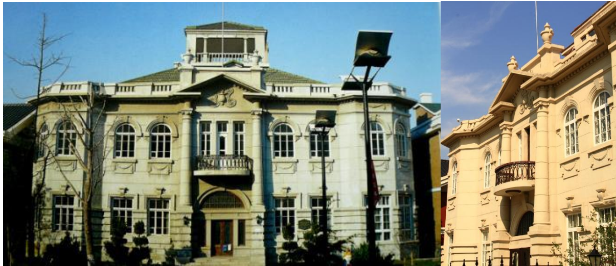
Figure 4. Consulate of Germany, built in 1900.

The lost building of the French consulate (closed in 1939) was established in April 1932 and was located at 101 Renmin Road, Zhongshan District, now in its place is the hotel.