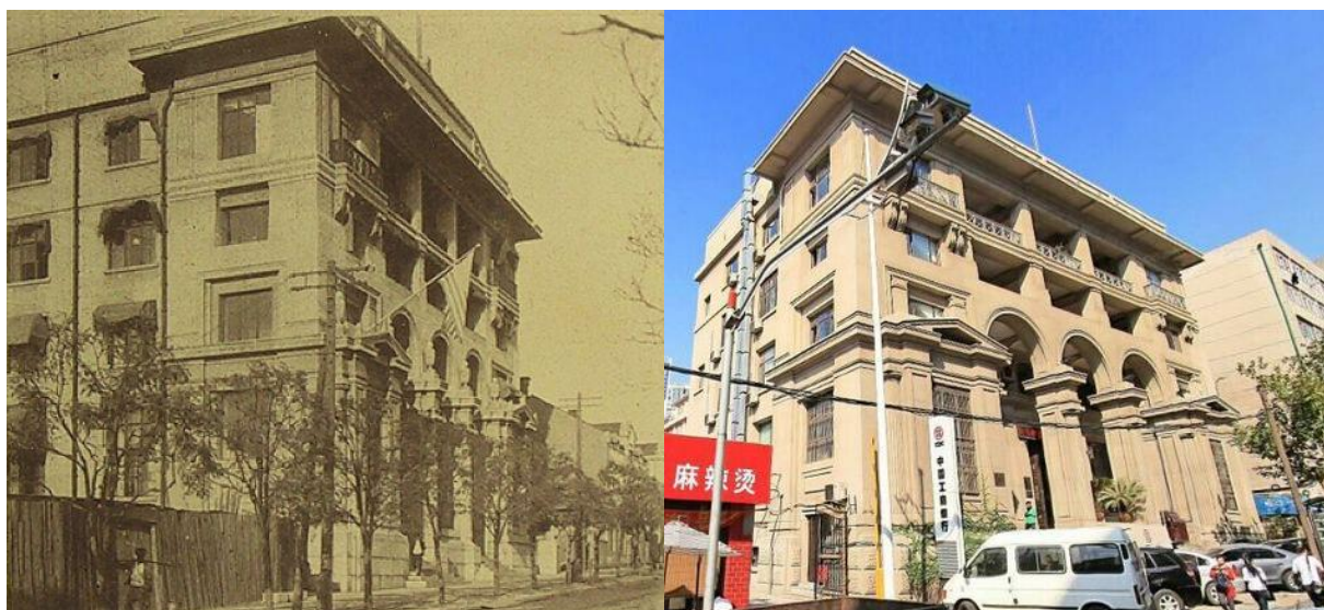
Figure 1. US Consulate, built in 1925.

The main facade has a complex expressive plastic solution achieved by using an arcade in three floors with columns of order system above which space on the fourth and fifth floors is formed by deep loggias. The center-axial symmetry is highlighted by the middle part of the facade opened by an arcade that stands out by massiveness due to the use of columns and high base, which gives the building a special monumentality. The upper storey, on the other hand, looks light, but squat due to a wide interstorey belt and pseudo-balconies with heavy pairing brackets. The entrance portal is raised above the ground level by two meters and is located in the depth of the arcade, flanked by pilasters. Accentuating the projecting cornice and attic curvilinear outline, fixes its place in the ensemble of the street. A distinctive feature of the building is its monumentality and presentable. The building now houses the Industrial and Commercial Bank of China (ICBC).