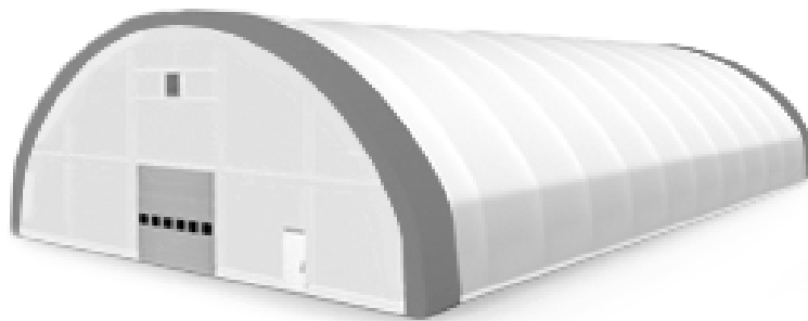
Figure 1. General view of a frame-tent structure.

Now, the frame-tent structures (prefabricated hangar tent structures) has widespread distribution on the construction market (Figure 1).