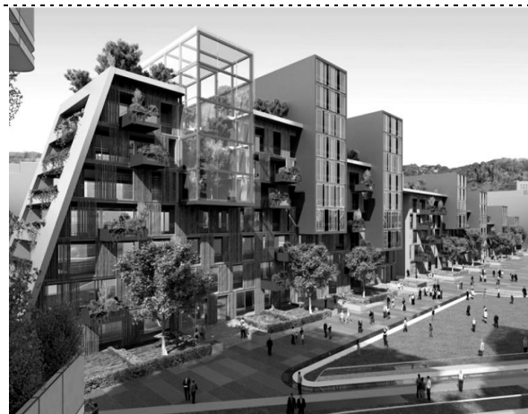
Figure 8. Example of a "green" building for the eco-district of Rome Citta della Scienza. Vincent Callebaut Architectures architectural Studio.

The trend has a conceptual focus on improving the environmental quality of urban education in General and their elements in particular.