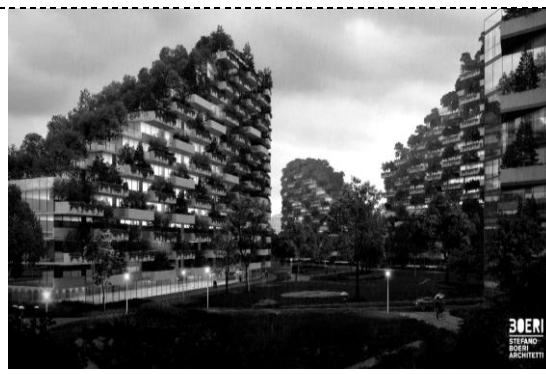
Figure 4. "Green" architecture, Lanzhou, China.