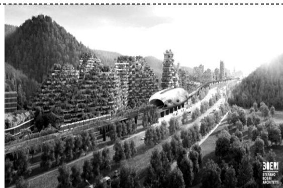
Figure 3. The concept of a "green" city Forest City Liuzhou, Lanzhou, China.