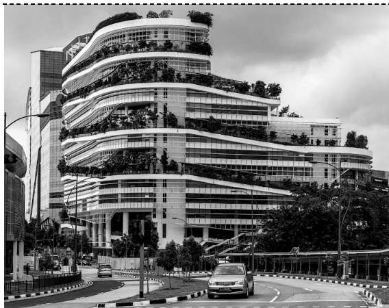
Figure 2. Solaris, Singapore.

Landscape architecture makes a lot of effort to harmonize the environment by greening urban areas. But the external "decoration" and even a significant increase in the external green Fund of the city today can no longer fully compensate for the "vegetable" needs of the urban guard [7]. It needs biologically closer contact with the living plant, which, unfortunately, is increasingly lost. In many ways it is the problem of architecture, which arose relatively recently, and therefore insufficiently disclosed.