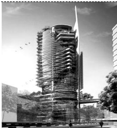
Figure 1. Editt Tower, Singapore.