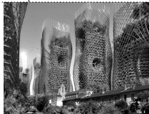
Figure 6. "Green" building. The 2050 Paris Smart City. Vincent Callebaut Architectures architectural Studio.

Another equally important project of Vincent Callebaut's Studio was the project of the eco-district in Rome (Italy), fig. 7-8. The project has an environmental focus and demonstrates the trends in the