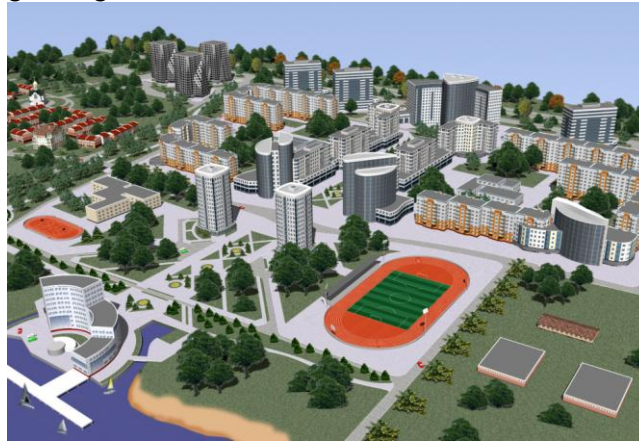
Figure 2. The diagram of the general plan for the version of ‘Orelproekt’ project (bird's eye view).

The necessary living standards should be established on the basis of statistical data for developed cities and depending on the living conditions. The obtained results can be compared not only for different cities, but also for one city in the historical context with the level of population development. These and other indexes should be used as normative indexes of the master plan and serve as substantiation for making managerial decisions.