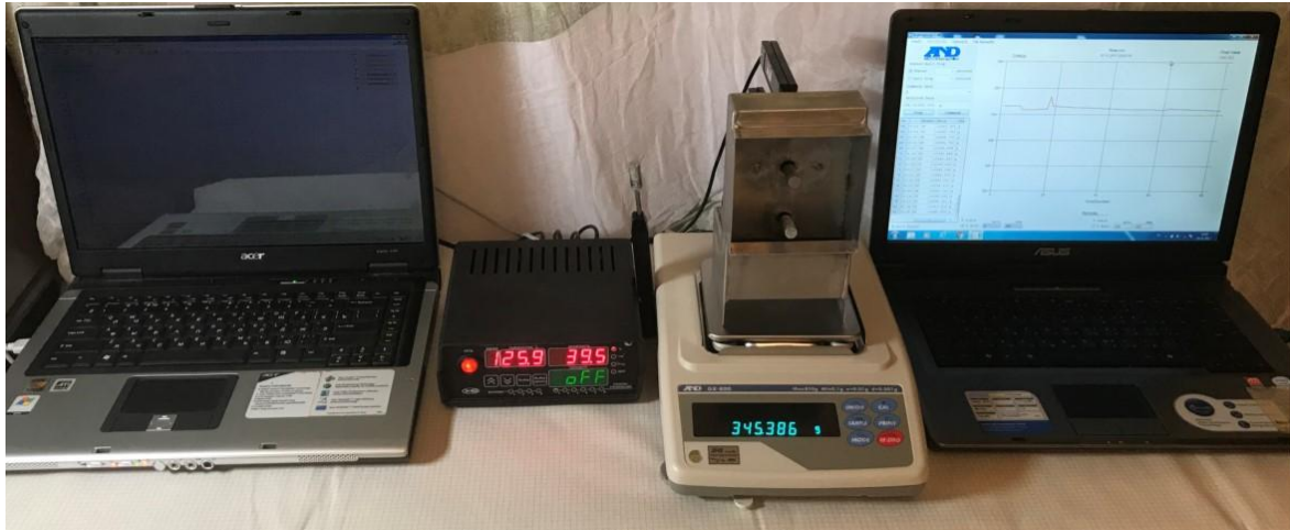
Figure 3. General view of the device connected to computers.

Material vapor permeability coefficient is defined by well-known relation: