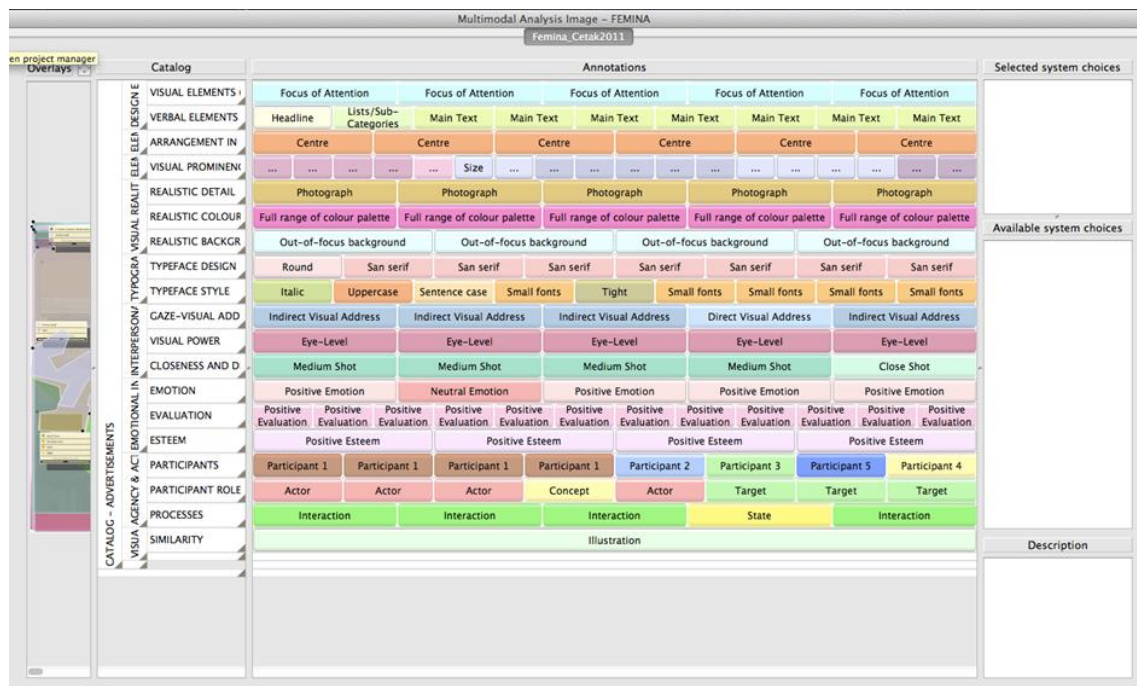
Figure 2. Results comparative quantity of multimodal analysis on printed Femina Magazine

Visualization of the fashion sections is described by multimodal analysis. The multimodal analysis software is being used for the annotation, analysis, search and retrieval of semantic patterns in unified but complex semiotic acts – for example, the interaction of gesture, gaze, intonation, camera angle, and music in a film. In addition to providing a digital platform for multimodal analysis, the software provides the site for further development of multimodal theory as the analytical techniques and tools produce insights into the nature of the multimodal phenomena. The approach is located within the digital humanities paradigm that promotes the use of computer techniques and technologies for humanities, arts, and social science research [5].