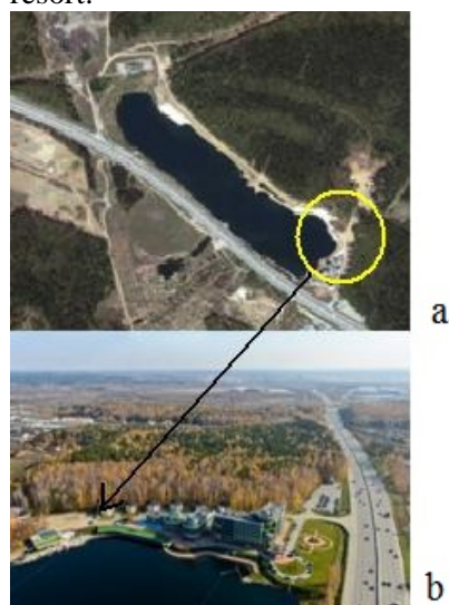
Figure 3. The flooded quarry with recreational improvements on its shores (the facility location: Ekaterinburg; The facility position: Chkalovsky district, m-district: Poultry farm) a) satellite image of the flooded quarry, b) air survey of the hotel resort "Ramada".

along with economic benefits: the quarry became a water facility with a recreational area and a hotel resort.