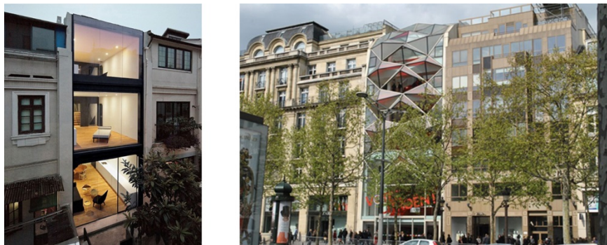
Figure 2. Examples of visual pause and visual accent.

Changes in urban space originate from those in cultural paradigms. As a result, new scale and silhouette building specifications appear. Social and cultural processes emerging in a society result from lifestyle changes. Increased demand for moving in urban space led to transport domination [10]. Because of heavy traffic on traditional streets they become less attractive, traditional functions disappear, people flee from houses located on these streets [11].