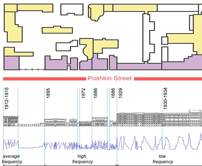
Figure 3. Pushkin Street in Ekaterinburg. Visual analysis.

At all times “religious and political structures should dominate over urban area and from their interaction the silhouette interpreted as the artistic whole was born in vision field” [18]. In most European countries the dominance of temples and town halls over surrounding housing has remained. However, streets have undergone evolutionary changes without destroying their structure that is favourable for the integrity of urban space perception. The district of ribbon building with the inclusion of architectural monuments and ensembles is aligned height. A so-called “reference” house plays the part of high-rise dominant and peculiar point of reference for space perception in the traditional type of a street. I.G. Lezhava uses the term “reference” house to represent unique structures dominating over surrounding districts and fixing some point for space perception [19].