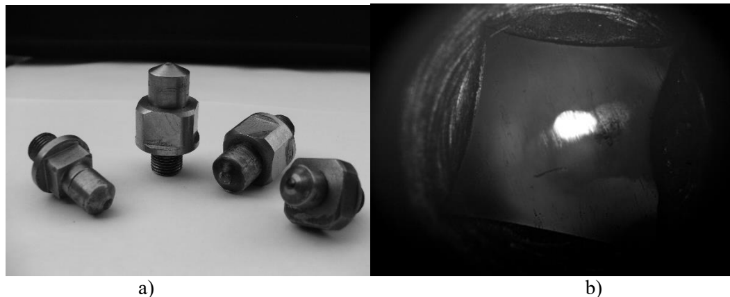
Figure 1. Burnishing tools (a) and a picture of the tool surface with maximum magnification X800.

Identification of the burnishing state of tools after the standard and ultrasonic burnishing was carried out by optical microscopy on a metallurgical microscope "Labomet" with a maximum X800 magnification and using laser scanning microscopy on a Lext microscope (Japan) (figure 1).