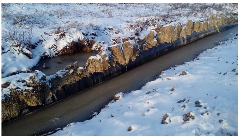
Figure 1. Defective pipeline section.