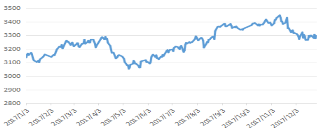
Figure 1. Part of the closing price chart from China stock exchange

Data preprocessing is a very important step when you want to get some information from data sets to help you make the prediction. As the initial data may have a lot of noise, it is necessary to reduce them so that they will not interfere with you result. Besides, because some features of data may make no sense, in order to improve efficiency, you should neglect them when you train the data.