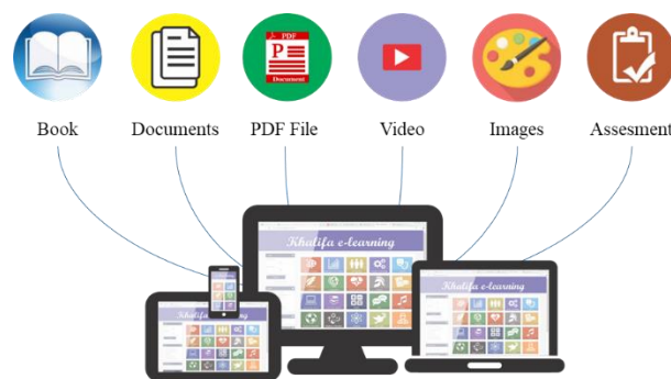
Figure 3. Multimedia content on e-learning system.

This study focusses on examining determinant factors in the utilization of multimedia in e-learning. Multimedia is a digital product that presents and combines text, images, sounds, audios, and videos, which is implemented through tool and link , so that users can navigate, interact, work and communicate [13]. In education, multimedia is used as learning media, which can be used by autodidact or students in the class [14]. Multimedia in the learning process has proven able to: create a fun learning atmosphere[15], enhance learning motivation [15], improve the effectiveness of learning [16], increase the understanding level [17], create student-centered learning [18], and enhance the investment efficiency of learning tools [19].