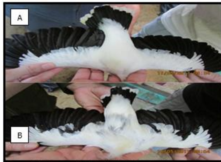
Figure 4. (A) pure and (B) hybrid black-winged myna.

The pure black-winged myna is dominated by white feathers, black feathers can only be found on the wings and the tail of the bird. For the hybrid, some black or gray feathers can also be found on the back, nape, breast and flank of the bird. It is not normal and becoming the characteristics of hybrid birds. Morphologically, the hybrid can easily identified by noticing the anomaly feathers. it is important to make sure that the birds are on their mature age which is at least two years old. it is very important to ensure the bird will not experiencing morphological change anymore. Based on the morphometric data that has been analyzed using PCA method, there are three main factors that can be the most distinctive factors. There are wingspan from component 1, circumference from component 2 and anomaly feather from component 1. Figure 4 will shows how the hybrid and the pure black-winged myna data in a scatter dot graph based on the data and the analysis result.