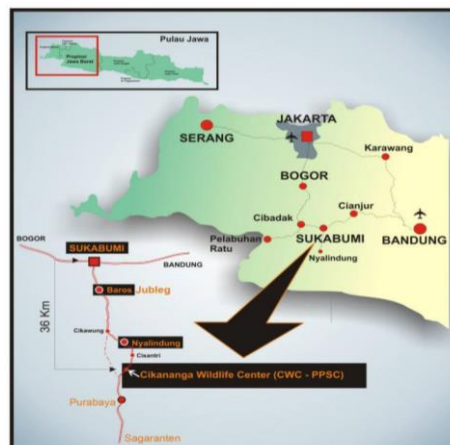
Figure 1. Cikananga conservation breeding center location map.

The data was taken at Cikananga Conservation Breeding Center (CCBC) located in the southern Sukabumi, West Java, Indonesia (figure 1). The goal of CCBC is to breed Indonesia's endemic species, threatened from extinction to preserve their integrity (through managed breeding) and release them back into their habitats in their geographic range. One of the animals is black-winged myna. CCBC is very successful in the breeding program of the bird. They also have a good management and record of it and it is helping the research in many ways. The research was focused on black-winged myna, and the birds at CCBC are available for the research. The location of CCBC can be seen on the image below (figure 1).