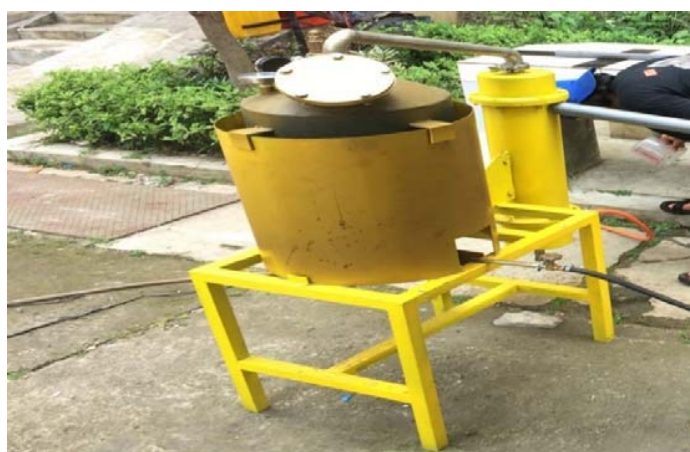
Figure 1. Schematic of synthesis fuel oil from poly propylene waste plastic with pyrolysis methods.

Polypropylene plastic waste shredded, weighed 3.0 kg, and put in a reactor and heated to a temperature of 400 ° C, and the resulting steam is condensed through the condenser crossflow. Fuel oil produced liquid, conducted tests among others, test density, octane value test, test the quantity and quality of fuel liquid materials with GCMS and test liquid with liquid fuels functional groups by FTIR. Tests carried out at the Forensic Laboratory, Police, Customs laboratory BPIP Jakarta, and LEMIGAS in Jakarta.