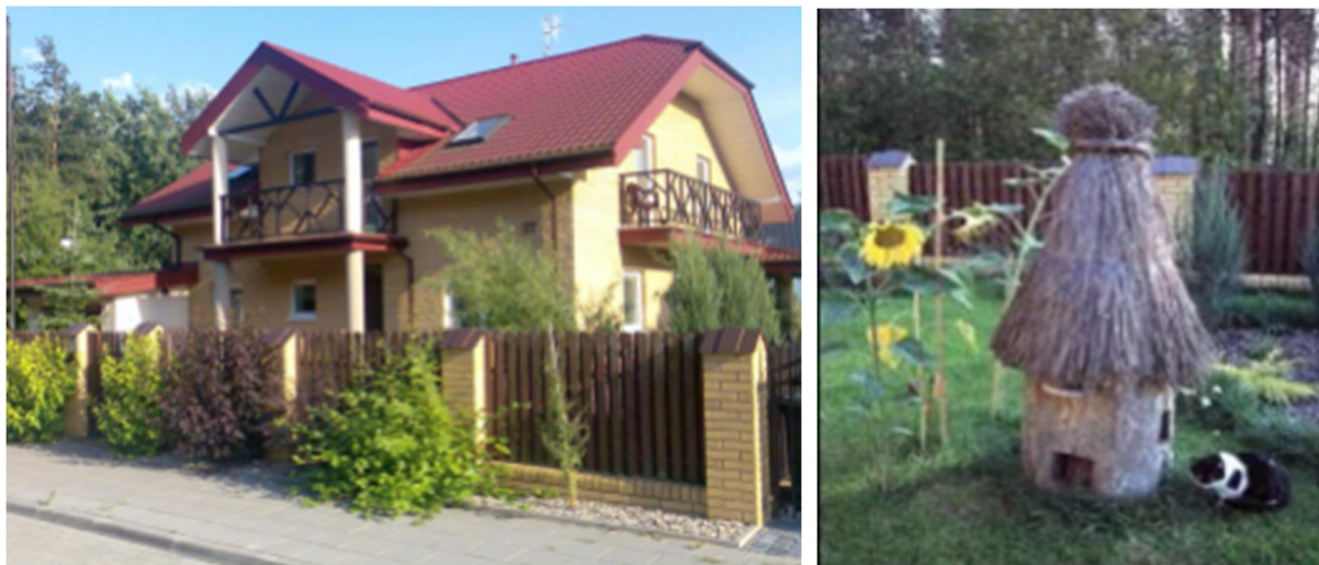
Figure 1. View of the front façade (NW direction) of the low-energy building LE1 (the LE2 building in addition to the color details is identical) - and the air intake to the ground heat exchanger

LE houses are equipped with mechanical ventilation system with heat recovery. The external air is supplied to the recuperator via a ground heat exchanger in which the ventilation air entering the interior of heated zone is preheated. In the summer season, after exchanging the contribution in the recuperator to the "summer" ground heat exchanger is used to cool the air blown into the building. The effect is obviously far from the standard air conditioning, but it allows to obtain a reduced internal temperature during the 24 hours during the highest outdoor temperatures.