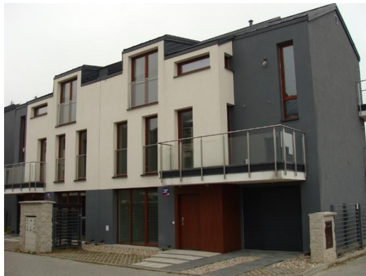
Figure 2. View of the front façade (S direction) of the building - NF40 (1)

The building of NF40 class - NF40 (1) (figure 2) located in Warsaw is a semi-detached building, without a basement, three-story, with an area of 269,4 m 2 (with a garage in the block of the building) and a volume of 759.8 m 3 . A foundation slab was made in this building with polystyrene of 20 cm thickness. The walls were made of 18 cm calcium-silicate blocks and polystyrene 20 cm (15 cm in the garage). The building has a gable roof, wooden with a layer of thermal insulation in the form of mineral wool 30-40 cm thick. The windows are three glazed, tight, with a noble gas. Doors are insulated. The source of heat in the building is a dual-purpose, condensing gas boiler. In most heated rooms, a floor system was used, and only in bathrooms on the second floor, wall heating.