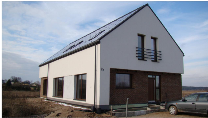
Figure 3. View of the building (S and E direction) of NF15 class - NF15 (1)

The basic thermal characteristics of the baffles of the analyzed buildings are shown in Table 1.