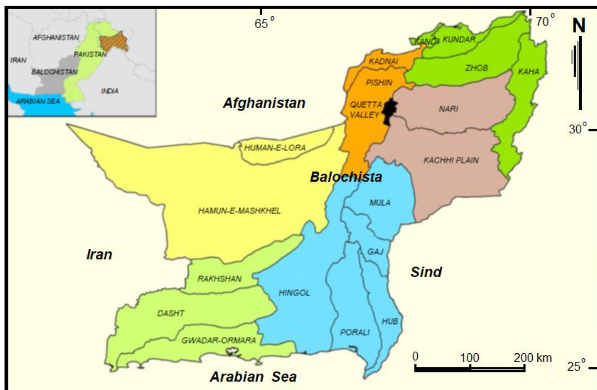
Figure 1. Balochistan plateau, 18 River Basins and Quetta Valley, [1].

The main three water sources of the province; the largest is floodwater comprise of seasonal flood flows. The second is the IBIS consists of perennial and non-perennial water resources. The third is the GW abstracted by tubewells, dug-wells, karizes (underground water channels), and springs. The wasteful water usage, over-exploitation of GW and frequent droughts made the water management a complex and difficult task. Despite water scarcity, the provincial government does not have the capacity to manage the available water resources. To protect the natural resources, government agencies prepared several policies during the last two decades, but no policy has been implemented in its true spirit. The policies include protection and conservation of ecosystems, biodiversity, natural resources, environment effects of climate change, forests, rangelands, agriculture, watershed, surface water and GW resource management. The common aim of all policies is to conserve natural resources and to eliminate desertification and deforestation.