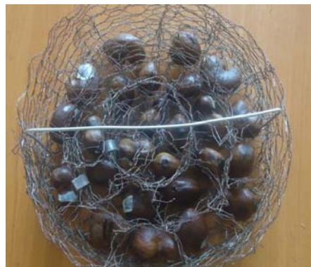
Fig. 1 Wire mesh basket

300 cashew nuts were selected from each nut size (i.e. large, medium and small). From these nuts, 25 nuts were selected, labeled and put in wire mesh basket which was divided into 25 compartment (see Figure 1). This was done in order to track each nut before and after roasting. The wire mesh basket was dipped into bath of hot oil at the temperature of 190°C-210°C for 90 seconds. This was done several times to complete the roasting of 300 nuts for each of the large, medium and small nut sizes. After roasting, the nuts were allowed to cool naturally for 18 hours [9, 11-12].