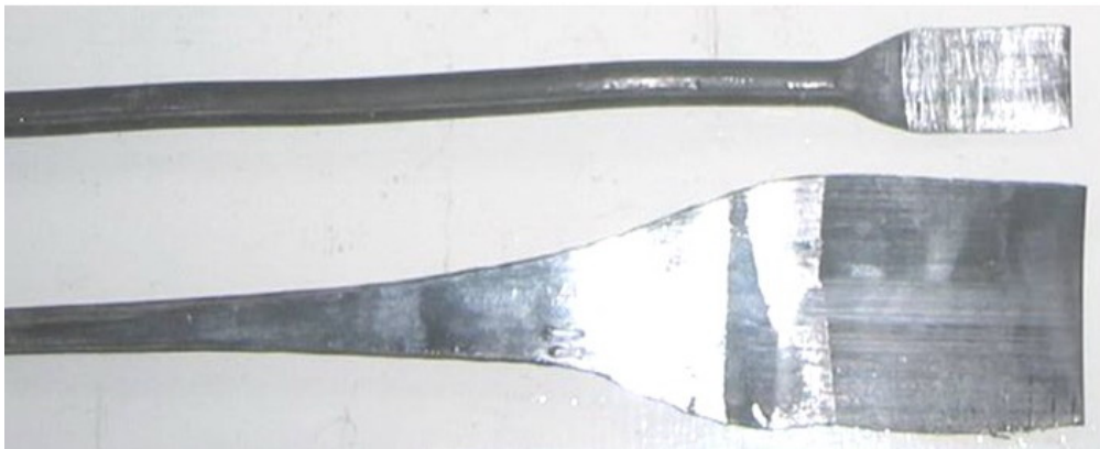
Figure 2. The broadening value after deformation in the rolls (the upper sample) and by the “Conform” method (the lower sample).

Processes that provide large values of broadening are of interest when implementing the technology of flattening. The main task of flattening is to obtain strips from a round billet with the maximum value of the broadening. Products obtained by flattening are in demand, however, the possibilities of the rolling process used for this purpose are limited and the search for new solutions in particular the application of the “Conform” method is promising and relevant.