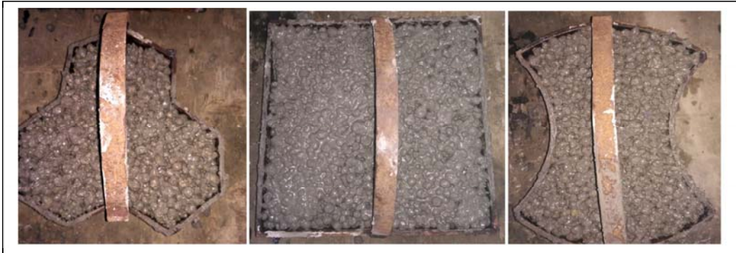
Figure 2. Fly ash based Pavement material

As the demand of pervious concrete gradually increasing day by day ,so various design of pavement materials are prepared in laboratory scale and which can be implemented in parking lots and other areas which shown in Figure 2.