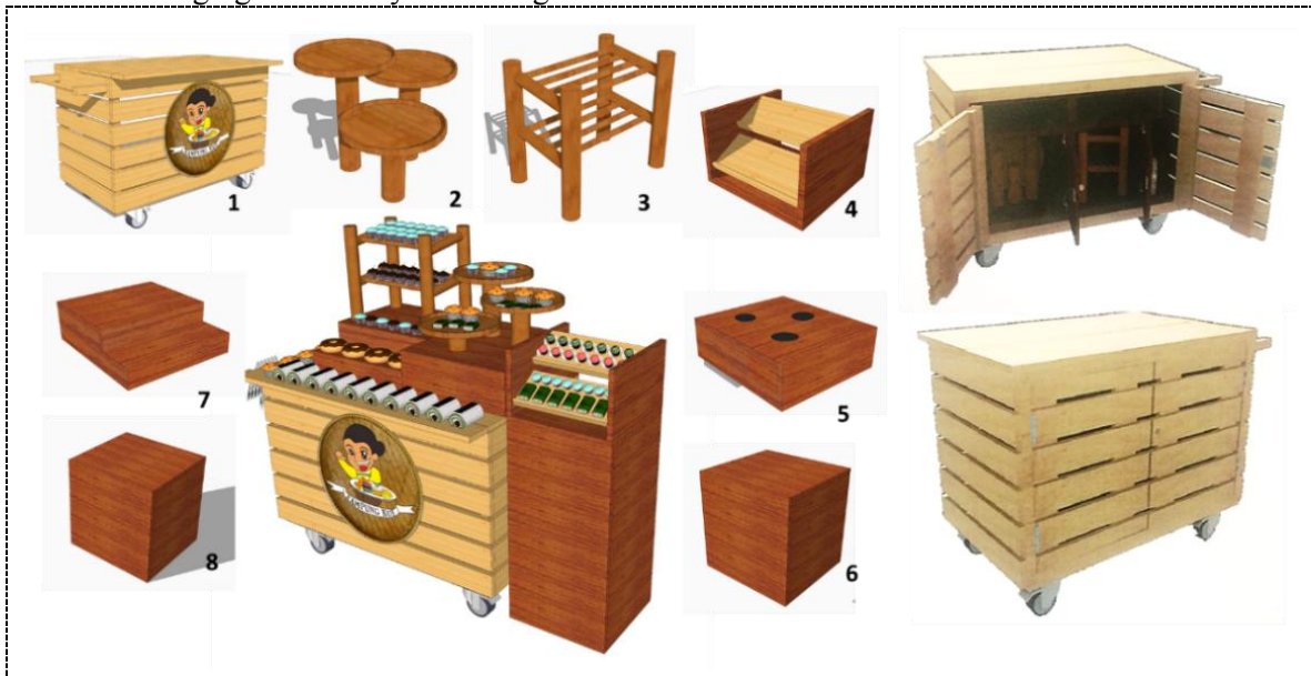
Figure 5. Designers develop a multi-function furniture product for pastry display that incorporates traditional Indonesian modes of display (image by Diana Thamrin and Charles Hartanto)

stacked on, can function as a packaging table. The fifth module is a simple wooden box with holes that support the vertical position of bamboo stems mounting the bamboo plates. The seventh module is a simple stair-like box that helps in dividing the display between different types of pastries. Finally, the sixth and eight modules are simple storage boxes needed by the pastry vendors to store excess pastries and other belongings when they are selling on the streets.