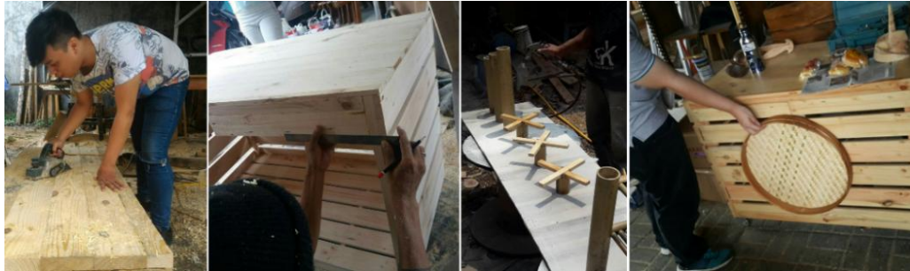
Figure 6. Production of furniture product using naturally artistic yet economical materials such as teak pallet wood, bamboo stems and traditional woven plates.

stacking system of construction enables them to be changed from time to time. The readily-available and simple materials used yielded a relatively economic product in terms of production. This would truly benefit the pastry vendors if they need to repair or develop the product in the future.