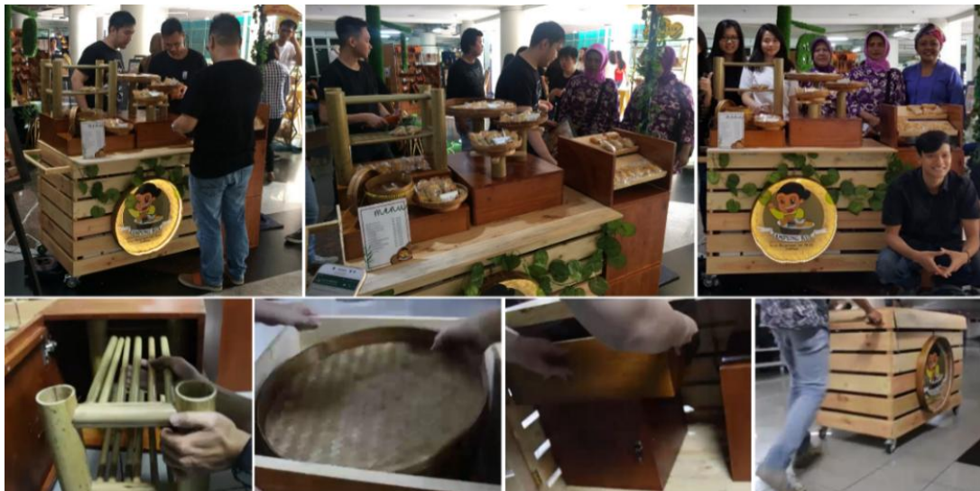
Figure 7. Testing of final furniture product by both designers and pastry makers