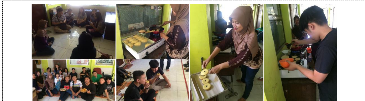
Figure 1. Designers learn to empathize and participate in the activities of the pastry community

Hence, together with the community, the design team discovered that an adaptable, practical and movable furniture product would truly be beneficial for them such that they could independently sell their products at any time and space available. Through empathy maps, discussions and affinity diagrams, the design team defined the problems and factors to be considered in the product design in terms of form, function, performance, producer's interest, marketing and production (figure 2).