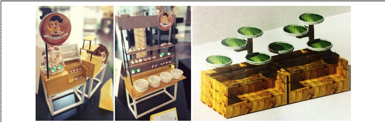
Figure 3. Designers develop modern furniture products for pastry display that incorporates traditional Indonesian modes of display (Mock-up by Claudia Filiana and Eko Prasetyo).

acquired. The pastry makers favoured the traditional display modes of using woven bamboo plates and display levelling system as they enhance the image of authentic Indonesian culture. They also favoured a display system that can adapt to exterior and interior spaces, and that could be kept easily when not in use.