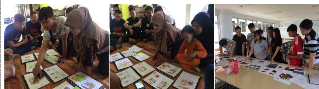
Figure 4. Participatory method of design evaluation with pastry makers and design peers