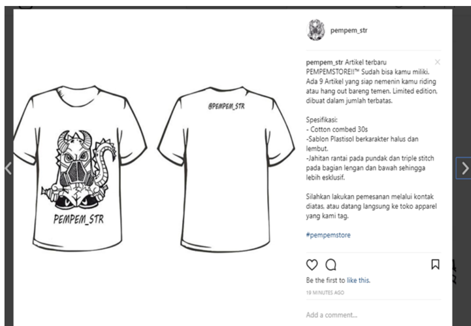
Figure 2. Material description.