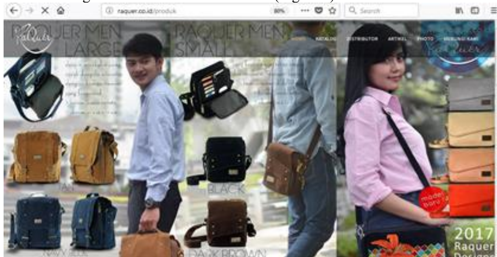
Figure 2. Raquer Website

RAQUER has many types of bags that are in production both for women and for men. In the website there is a service to access the product catalog and description so that it can facilitate consumers to choose the goods in the search and desired (Figure 2).