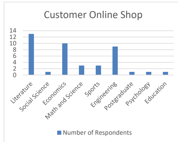
Figure 1. Number of Respondents.

traditionally, while five others do not believe in online transaction. The 43 respondents who have done online shopping grouped into each faculty, shown in the Figure 1.