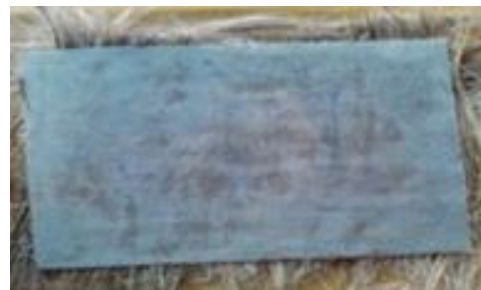
Figure 2. Processing of Hemp/Glass fibre