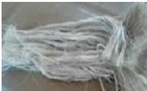
Figure 1. Raw hemp fibre

The top surfaces of the base plates were cleaned by applying thinner chemical after removing the dust and burns on the surfaces by scrubbing with aid of an emery sheet. The wax coating was given on the surfaces of base plate after cleaning, and then the coated plates were kept under ambient conditions for 15 minutes for hand lay-up process [1]. The matrices were prepared by mixing the epoxy resin and hardener with the ration of 10:1 and uniform mixing was done with regular interval of time period. The pot life of these matrices was identified as 30 minutes based on the standard laboratory readings given in the chart. At the initial stage, hemp fibres were kept under sun light for 8 hours to remove the moisture content presents in the fibres. The composite laminates were fabricated by applying the matrices between the glass and hemp fibres with constant weight. Each laminate consists the five layers of hemp and glass fibre by hand lay-up process. The glass fibre mat was used on the top and bottom layers of these composite laminates. The dimensions of the fabricated composite laminates were restricted as 275 x 275 x 5 mm. Then the fabricated laminates were dried under room temperature with aid of the compressive load for one day. The following figures 1 and 2 are shows the fabrication process of composite laminate with raw hemp plant fibre and glass fibre [18-19].