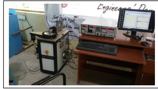
Fig. 2 Schematic diagram showing the pin-on-disc wear apparatus.