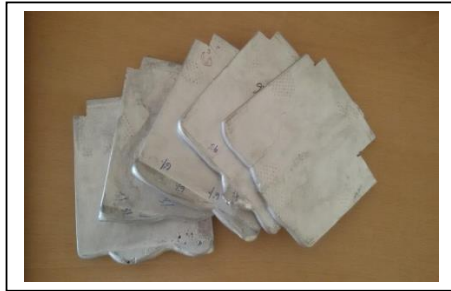
Fig.1 Schematic diagram showing plates of Al6061/Gr composite produced using stir casting route.

In the present research, the as cast and heat-treated Al6061/Gr MMCs (ref. to Fig. 1) produced using stir casting process has been considered to conduct the experiments on the pin-on-disc apparatus (ref. to Fig. 2). The independent parameters, namely applied load, sliding distance, percentage of reinforcement and sliding velocity are considered as input process parameters and the weight loss (WL) is considered as the response. The range of input process parameters considered in this study are given in Table 1.