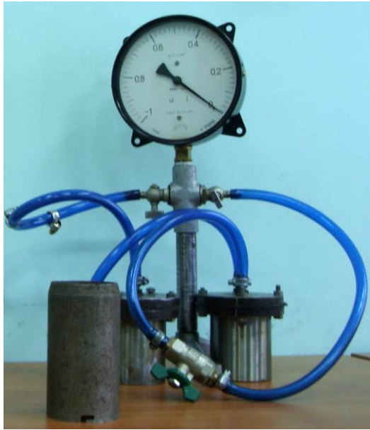
Figure 2. General view of the device.