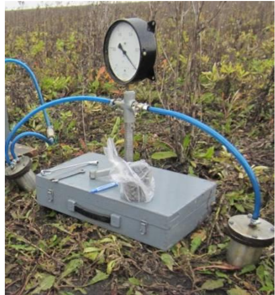
Figure 3. Field measurements.

We will write down the Cliperon–Mendelev law for gas in the vessels before and after the tap opening: