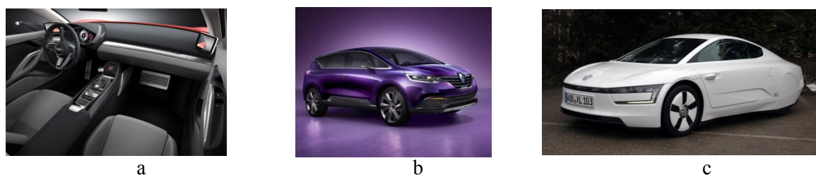
Figure 2. (a) Concept car Nanuk Quattro [3], (b) Concept car Initiale Paris [4], (c) Volkswagen [5]

It is also necessary to highlight the development of the Volkswagen XL1. The developers propose to use the rear view camera instead of the side mirrors [5] (Figure 2c).