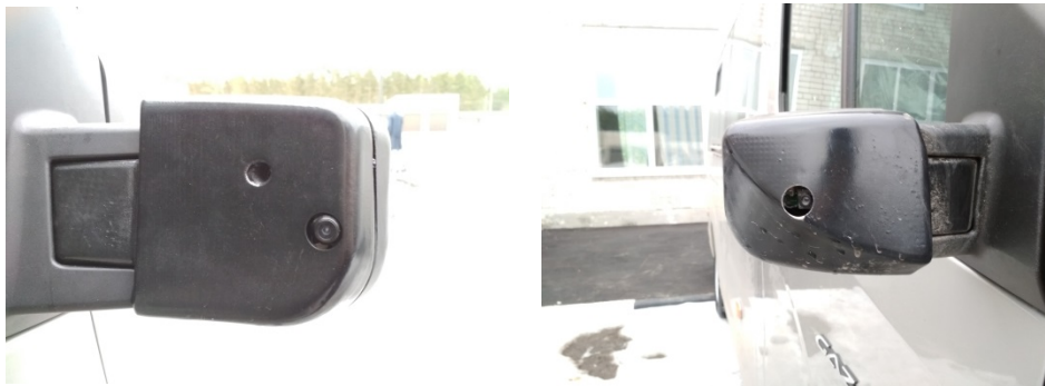
Figure 8. Brackets for attaching video cameras

Using cameras instead of external side mirrors gives a larger viewing angle, and the right angle allows the driver to correctly assess the traffic situation.