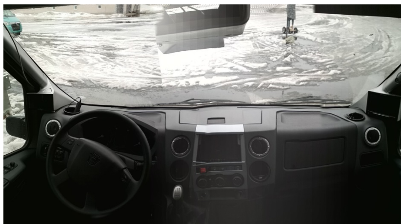
Figure 7. Interior elements of the GAZelle NEXT

At the next stage, the elements were made according to computer models. After manufacturing, the elements were installed in the car's interior (Figure 7).