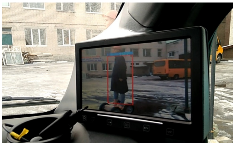
Figure 9. Successful braking in front of a dummy simulating a pedestrian

It should be noted that the braking was carried out after the start of the warning signal. A fragment of successful braking in front of a dummy simulating a pedestrian is shown in Figure 9.