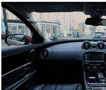
Figure 1. «Transparent» pillars of the Jaguar [2]

In order to exclude these shortcomings, work is underway to reduce or partially eliminate the blind spots of the car. For example, the Jaguar Land Rover group introduced the 360 Virtual Urban Windscreen system (Figure 1), which is designed to improve the visibility of cars. The system allows you to project on the windshield pillars an image of a part of the road that is hidden by these elements of the car's construction [2].