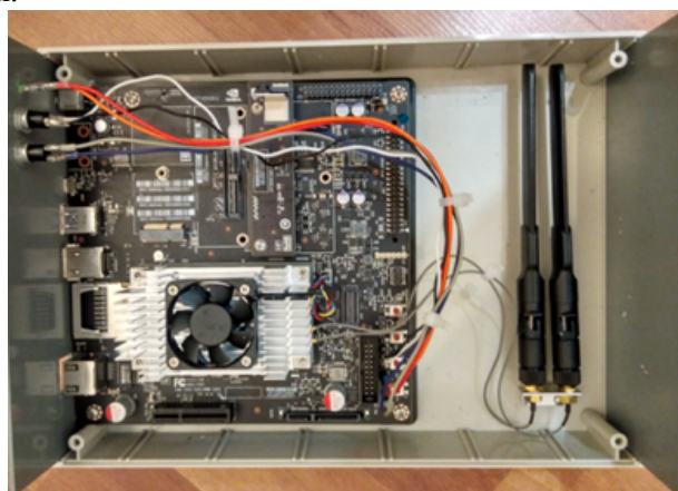
Figure 5. Assembling the on-board computer module

On-board computer NVIDIA Jetson TX2 is placed in a specially manufactured case, which is shown in Figure 5. This case allows to reduce the risk of damage from external influences (falls, impacts, etc.). Also in the case there is installed the air cooling system of the computational module to prevent overheating of the system.