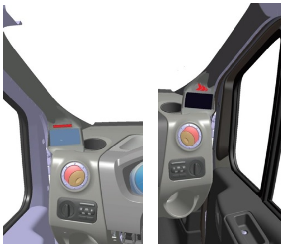
Figure 6. Computer models of car interior elements of GAZelle NEXT

For the installation of displays, computer models of plastic car interior elements were developed (Figure 6).