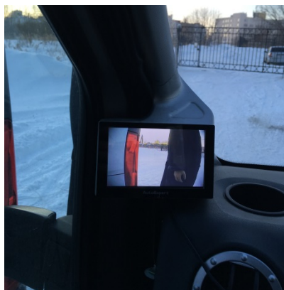
Figure 10. Work without a warning system about a possible collision with pedestrians

pedestrian crossing [1]. Fragments of tests carried out without a collision warning system with pedestrians are shown in Figure 10.