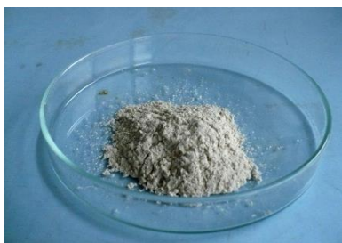
Figure 2. The expansive cement Denka CSA.

Expansive cement DENKA CSA is Calcium sulfoaluminate cement (CSA) cement produced from a special clinker and milled to the particle size of cement. It is off-white powder with specific density ca. 2860 kg.m -3 ; loose apparent density from 800 to 900 kg.m -3 ; tapped apparent density ca. 1500 kg.m -3 and specific surface by Blaine ca. 370 m 2 .g -1 . Synthetic gypsum or calcium sulfate (gypsum) is the end product of flue gas desulphurization. It represents chemically very pure material with a purity of 97-98% which is mainly used in the manufacture of cement and plaster. Further application is in the manufacture of plaster mixtures, aerated concrete and as a setting regulator. It is characterized by the moisture content of 10%; pH value of 6 – 9 and purity of 95%.