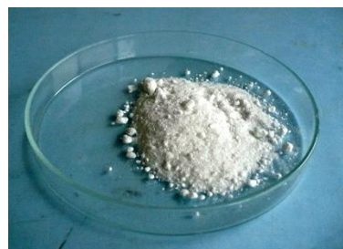
Figure 3. The synthetic gypsum.