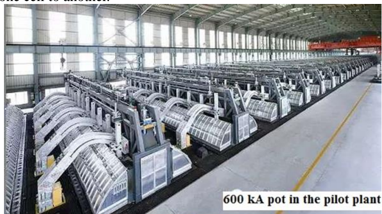
Figure 2 Potline of 600 kA prebake aluminum cells

Electrolysis cells in aluminum plants are arranged in long rows, called potlines where the cells are connected in an electrical series circuit with the transformer and rectifier systems located at one end of the potline. A typical aluminum smelter consists of one to three potlines. Modern 600 kA prebake cells are positioned in a side-by-side arrangement in potlines, as shown in Figure 2. In most designs, the cells are situated above ground with solid aluminum bus bars located at ground level below them with current flow from one cell to another.