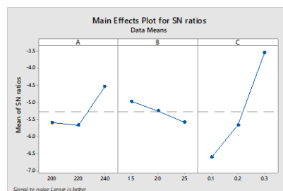
Figure 2 S/N ratios for optimum combination of responses

Present optimization results are MRR 276.88 mm 3 /min and surface roughness 1.061 μm. The optimal parametric condition results are 278.42 mm 3 /min and surface roughness 1.072 μm. There is very good agreement between present results with optimal condition with experimental results.