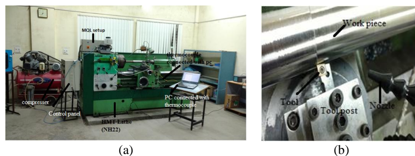
Figure 1 (a) Different parts of the experimental setup (b) Enlarge view of cutting zone with the nozzle.

In this paper, experiments were performed with Multi-walled carbon nanotubes (MWCNT) mixed nanofluid using MQL technique. The workpiece material AISI 304 stainless steel, hardened (29HRC), hardness (annealed) 82HRB was selected for machining using tungsten carbide tool (CCMT09T304-TN2000), and a tool holder (WIDAX SCLCR1212F09 D 3J). The initial dimension of the workpiece was 70 mm x 300 mm. K-type thermocouple with NI TC01 device was used to record the cutting temperature during experiments. Fig.1 illustrates the complete experimental setup used in turning operation.