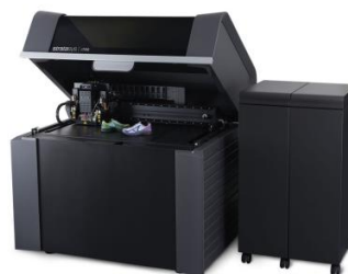
Figure 2: Stratasys object connex multi-material 3D printer

An important part of Skylar Tibbits work allows researchers to program different material properties into various particles of designed geometry and obtain different water-absorbing properties of materials to activate the self-assembly process. Here the activation technology is water. This activation technology has new possibilities for including programmability into non-electronic materials. For example a robot like behaviour without depending on complex electro-mechanical devices.[6]