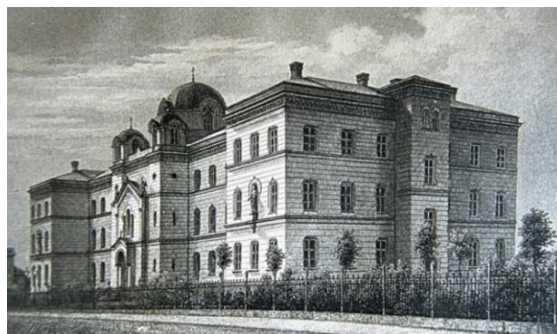
Figure 1. The workhouse of Firs Sadovnikov, 1823

Besides, on-site investigation of modern institutions such as Community centre (DK) (ZIL, Moskwitch), CPE (Fenix), contemporary city models (Masterslavl, Kidzania) was conducted. Investigated institutions underwent through reorientation and lots of minor renovations. For this reason, the original concept of colours and forms was lost for each of those spaces. The layout design of the educational spaces was to some level ruined as well. Some of investigated institutions have more decorative qualities than thought through architectural implications. Even so, the attempt to create suitable surrounding by adding such features as artificial greenery, interior zoning etc. is noticed. (Figure 2)