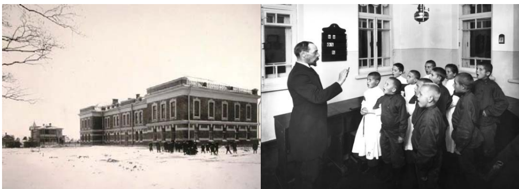
Figure 2. Mariinskaya School for deaf-mutes. Saint-Petersburg county, Murzinka. The spoken language lesson in primary school. 1907