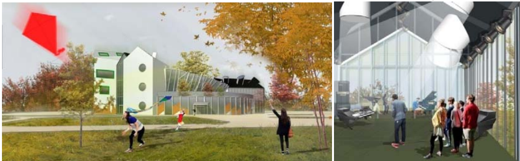
Figure 5. The new format CPE institution:Space for Finding Your Life's Purpose

Space for Finding Your Life's Purpose is the CPE institution of new format design experiment that was developed in order to confirm the effectiveness of architectural neurotransmitters. (Figure 5)