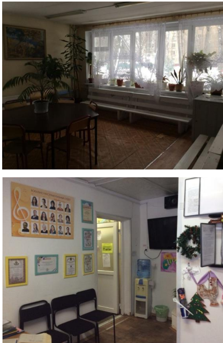
Figure 3. Photofixation. The waiting room for parents and sitting room of SE Institution “Fenix”

In addition to the above said, the genuine field investigation of modern institutions was completed: Community Centre (ZIL, Moskvitch), Palaces of Pioneers, supplementary education institutions (Fenix), modern models of cities (Masterslavl, Kidzaniya). The investigated institutions had undergone the repurposing process and multiple cosmetic repairs. That all caused the loss of venues authors' concept regarding colouristics and shapes. The planning solution of educational space was also depraved. Some of reviewed institutional spaces have more decorative qualities than logically based architectural ones. Nevertheless, the tendency to create a proper environment by applying the additional features such as artificial planting, zoning with interior elements was noticed there. (Figures 3, 4)