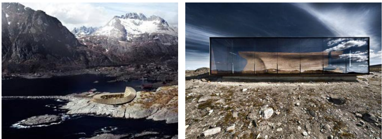
Figure 2. Norwegian Wild Reindeer Pavilion (Snohetta Architects, 2011.): interior and general view

Let us consider one more example from the Norwegian practice of the famous bureau: this is a very small structure, in fact a pavilion. The Norwegian Wild Reindeer Center Pavilion is located in the picturesque area of the Dovrefjell National Park on a high plateau Dovre Mountain in Norway (1,2 km above sea level) with a view of the Snohetta mountain range (Snohetta) [14]. Building space of 75 square meters is designed to serve tourists and excursionists. It plays the role of a "high-altitude shelter", in particular, for ecological education of schoolchildren (Fig. 2). Simple construction is not only a good way to integrate design into nature, but a tribute to local historical traditions in shape and building materials. Despite its simplicity, this building is made using the latest 3D modeling technologies to create natural organic forms of pinewood. The frame of the building made of unprocessed steel and rust on the outer walls is in harmony with the shades of the surrounding mountains rich in iron. In addition, it is traditional for Norway to use high-quality and durable materials that can withstand the climate of this place. The concept is based on the principles of sustainability, the preservation of cultural and historical heritage, integration into the natural mountain landscape. Important social tasks are fulfilled, which in general meets the criteria for the sustainable development of architecture.