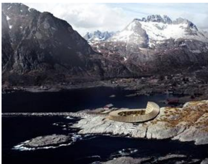
Figure 1. "Lofoten Opera Hotel" (Snohetta Architect)

Modern examples of "mountain architecture" are numerous and varied, among them the Museum of the Mountain in Italy by architect Z. Hadid [12, 96], an object in the Grace Farms preserve by SANAA [13] and others. The architects of Norway succeeded in this actively "mastering" the mountainous part of the country and the fjords especially. They strictly adhere to the principles of nature conservation. There is less strict state control, because the community sees a national idea in it. This is how the building was designed in 2010 by Snohetta in the archipelago Lofoten - Lofoten Opera Hotel (Fig. 1).