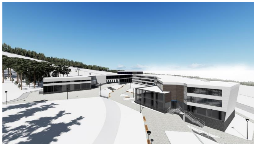
Figure 4. ‘At the foot’ complex general view

For architects, it was important not only to create a modern multifunctional facility for all age groups and levels of athletic training, but also to design a building integrated into the existing natural environment as much as possible; the idea of preserving the natural landscape and the “pattern” of the relief became the main one when choosing the overall layout and then space planning (fig. 4). The use of natural horizontal platforms, terraces and racks system determined the constructive structure. It gave dynamics to the overall composition consonant with the natural context and the principles of eco-stability, in particular architecture integrated into nature. The restraint and expressiveness of the architectural image, the methods of shaping are a tribute to the natural and climatic features of the Ural Mountains.