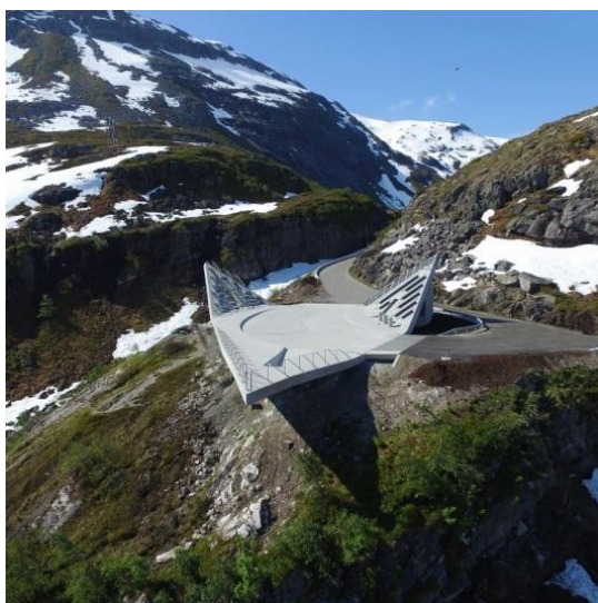
Figure 3. Utsikten's observation platform (Code Arkitektur)

to the authors' design (Code Arkitektur). Using traditional materials and technologies, architects achieved expressiveness solely through "extreme" plastics. Smooth to highly textured concrete finish reflects the entire diversity of the surface of the mountain landscape including vegetation and depending on the weather and lighting. This natural cover makes the structure fully integrated into the natural surroundings. The architects define that the finished platform is represented as an independent, geometric and "exact" object in the landscape.