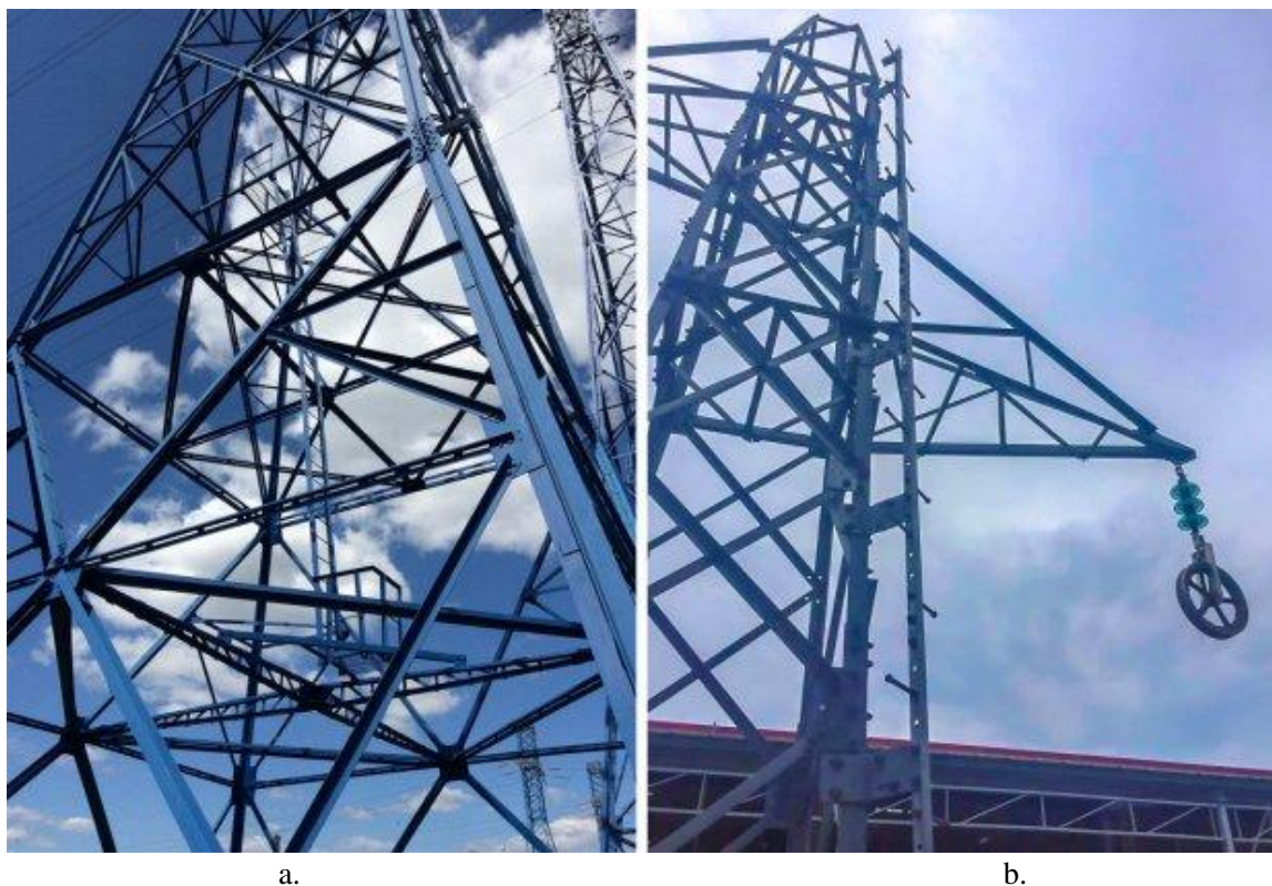
Figure 2. Some designs of operational ladders on power line supports.

As a rule, when climbing a ladder using PPE, a method of climbing with alternate support by each worker is used. At that, a step itself or a pole of the steps acts as an anchor point. After analyzing requirements of normative documents to vertical ladders and their elements [20-23], we can conclude that no element of a ladder can act as an anchor point able to withstand 22 kN. This means that climbing using alternating safety support against ladder elements is not safe and does not satisfy requirements of normative documents in the field of working at height [4].