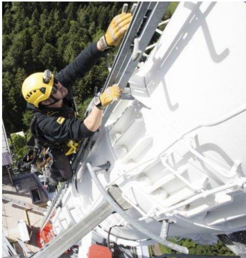
Figure 3. An example of a rigid anchor line along climbing on unfenced ladder.

The most optimal solution in terms of comfort, climbing speed and safety for a worker is installation of special ladders with a rail integrated into the rack, along which a safety clamp moves on (Fig. 3). This tool refers to PPE, but it is permanently mounted and can be used by several users, if it is stipulated by the manufacturer's instruction. But along with obvious advantages of this solution, there is an important disadvantage: rescue operations, if an emergency situation occurs with the upperworker and he is unconsciously hanging on the safety clamp. In this case, the time of rescue will be approximately between the rescue time with the remote method of providing safety and the rescue time when climbing with alternating safety support. This must be taken into account when planning work, and one should have a rescue kit for coming down.