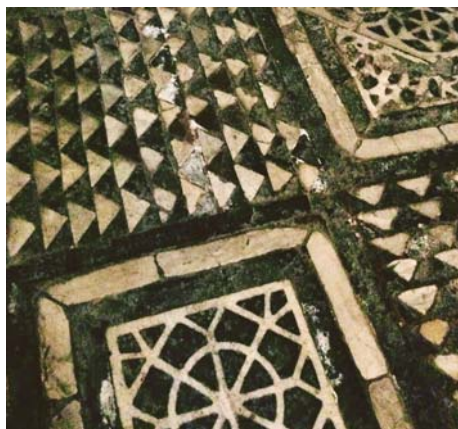
Fig. 1 - Detail of Baptistery floor, showing green (serpentinite) and white (marble) elements

The San Giovanni Baptistery is an outstanding worldwide monument, representing the oldest religious monument in Florence (Italy). Due to the lack of primary sources and specific dating issues, the Baptistery origins have been debated for a long time and are still controversial: different hypotheses, covering seven centuries, have succeeded. Among the hypotheses, it was believed built over the ruins of a Roman temple dedicated to Mars, dating back to the 4th-5th century A.D., or edified during the Longobard period [8]. The archaeological excavations effected in the period 1895-1915 seemed to strengthen the thesis of a medieval origin [9]. Recently, Bernabei et al. [10] studied the timber structure of the dome and obtained a radiocarbon dating of the chestnut from the 11 th -12 th centuries; also, they dated, through the dendrochronological analysis, a silver fir element to 1268. This date, possibly, represents a replacement coincident with the period, between 1270 and 1300, when a substantial part of the mosaics of the dome was positioned [10].